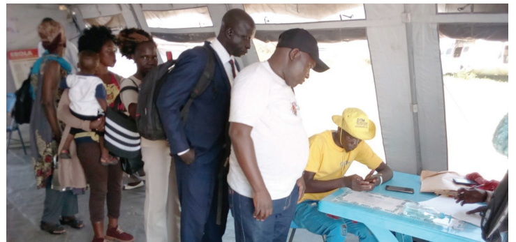
DTM Tracking at Yei Airstip PoE.

Based on data submitted by Monday 6 th January 2020, 3,385 individuals were surveyed in groups on arrival to South Sudan during the reporting period. The main regions of departure were Koboko (25.9% of respondents) in Uganda and Ituri (21.8%) in DRC, while the main reported counties of destination were Morobo (43.1%) and Kajo-Keji (19.1%). Most respondents reported South Sudanese nationality (64.3%), followed by Ugandan (29.4%).