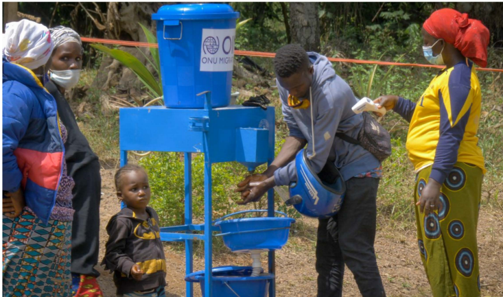
HAND WASHING AND TEMPERATURE CONTROL AT GOUÉCKÉ'S HEALTH SCREENING POINT.