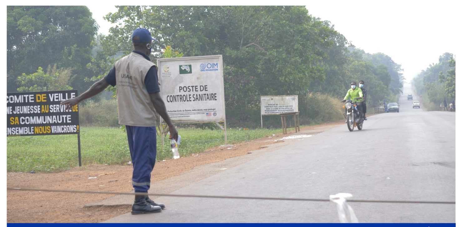
HEALTH SCREENING POINT IN BOKÉ, GUINEA.