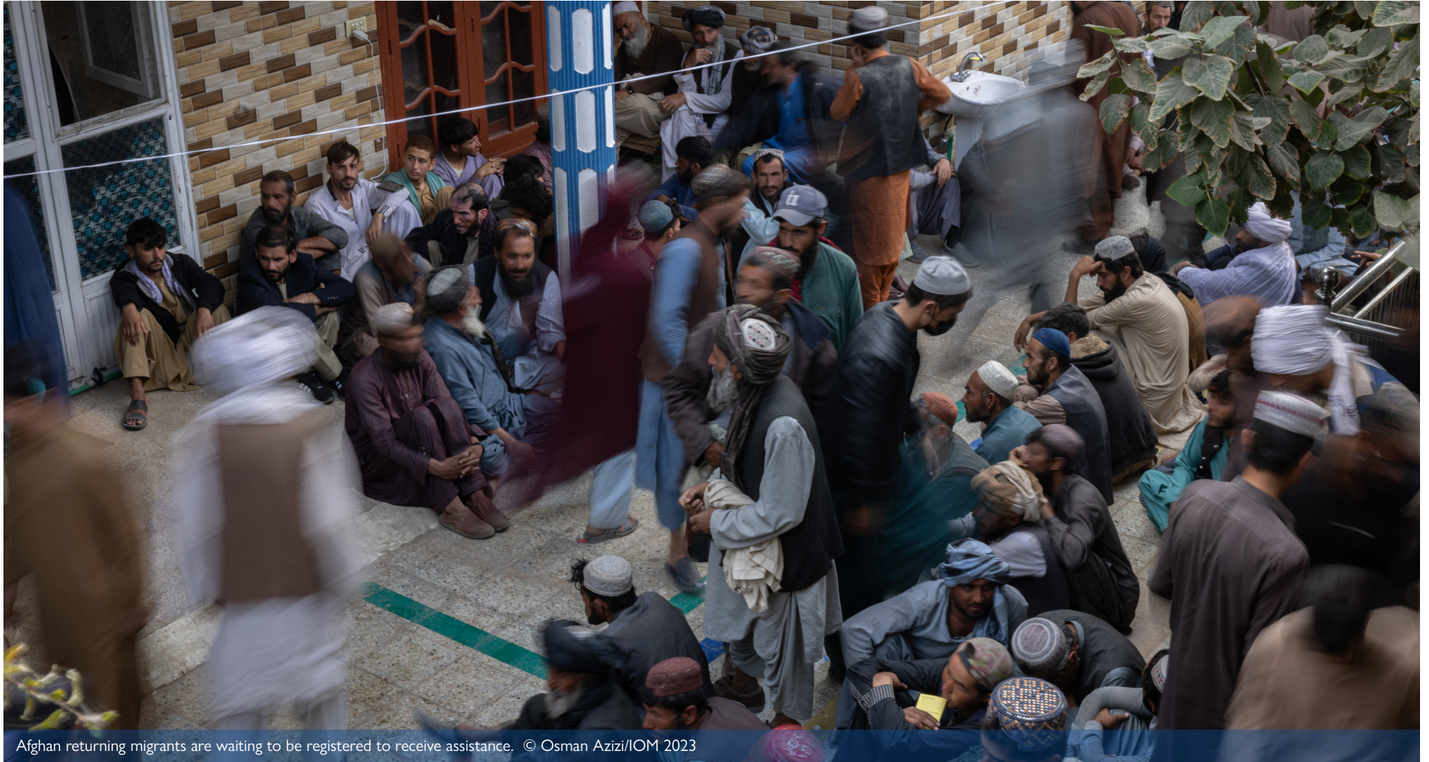
Afghan returning migrants are waiting to be registered to receive assistance.