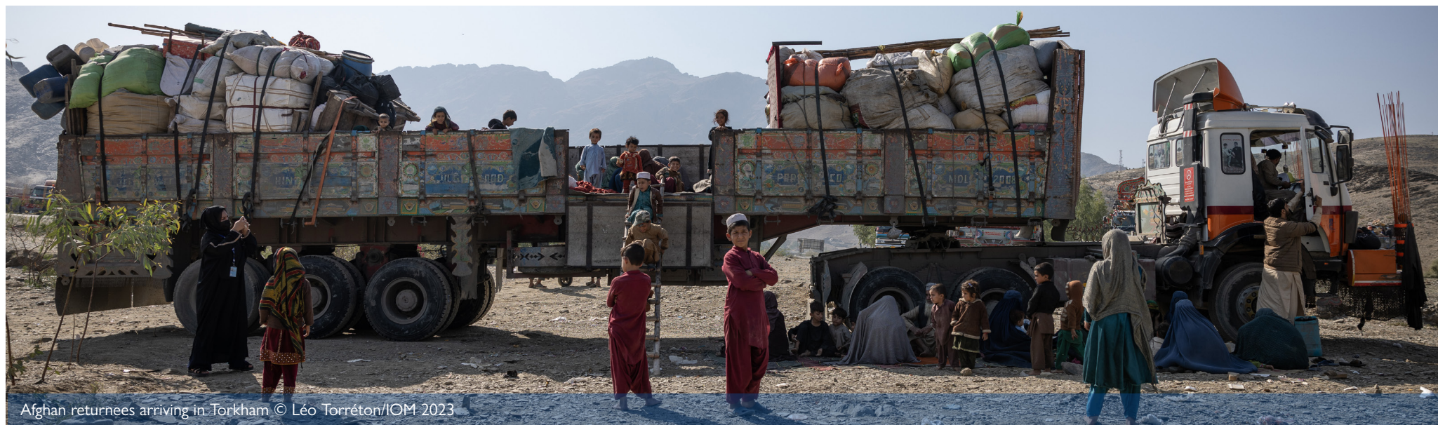
Afghan returnees arriving in Torkham