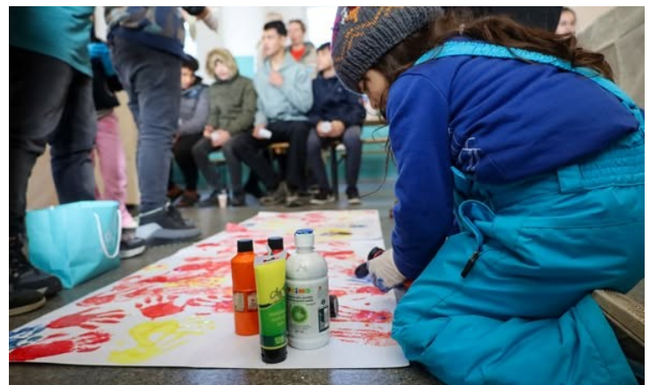
CELEBRATING INTERNATIONAL MIGRANTS DAY IN RECEPTION CENTRES.

IOM celebrated International Migrants Day on 18 December in all temporary reception centres (TRCs). In TRC Borići, local pupils and teachers joined children at the centre for activities promoting understanding and friendship. Children exchanged symbolic gifts, highlighting solidarity. In TRC Ušivak, local association Igman from Hadžići joined the celebration with a performance of traditional dances and songs. Beneficiaries rewarded the nice gesture of the community with gifts for all who were present, which they made during creative workshops in the centre.