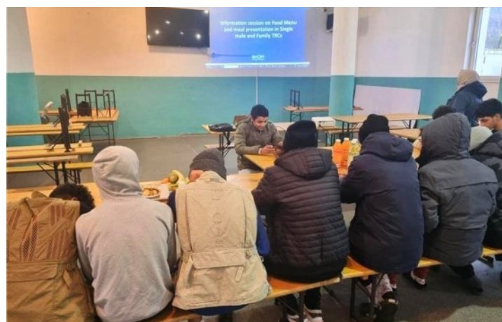
FOOD INFORMATION SESSION WITH BENEFICIARIES IN TRC BORIĆI.

# of beneficiaries reached with info sessions: 704