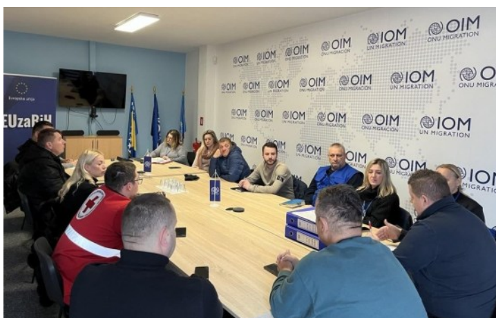
OPERATIONAL MEETING BETWEEN IOM AND RED CROSS.

Efforts continued to transfer food sector duties to Sarajevo Canton Red Cross staff in TRC Blažuj. IOM organized training for the Red Cross team to build their skills in managing operations, handling cross-checking delivery notes, maintaining paperwork, and using the Smart Camp Application for monitoring and reporting. This ensured a smooth transition while maintaining service quality.