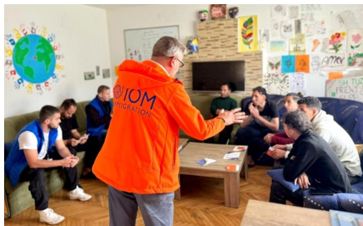
AVRR CONDUCTING OUTREACH ACTIVITIES IN TUZLA

# Assisted Voluntary Returns since 2018: 1,562 M: 1,378 F: 184