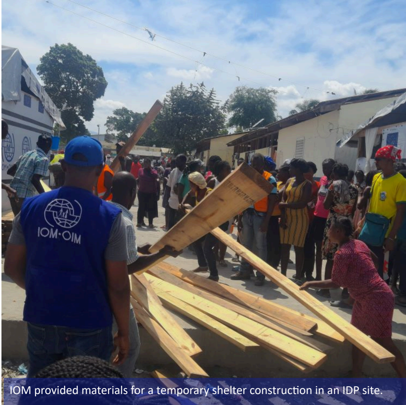
IOM provided materials for a temporary shelter construction in an IDP site.