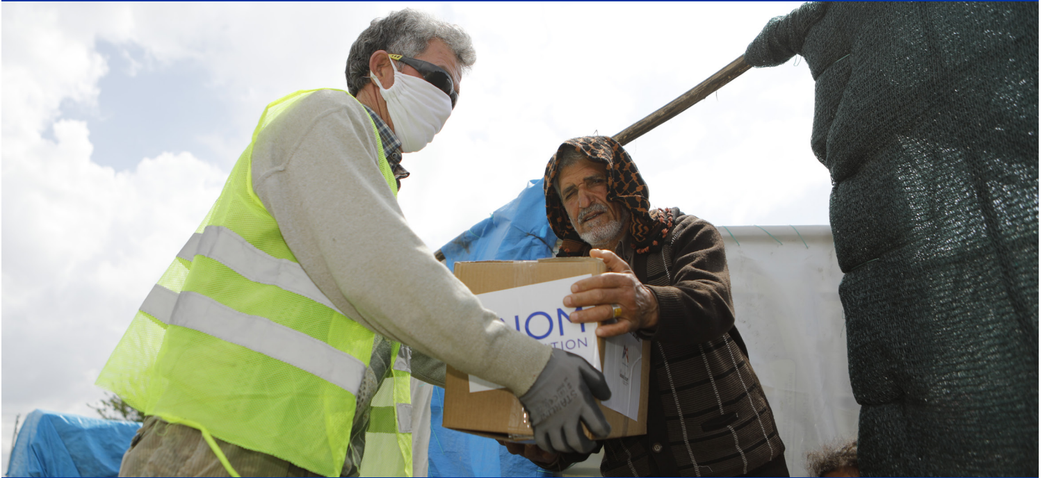
Syrian communities in southeast Turkey receive hygiene kits to help combat the spread of Covid-19 in the region