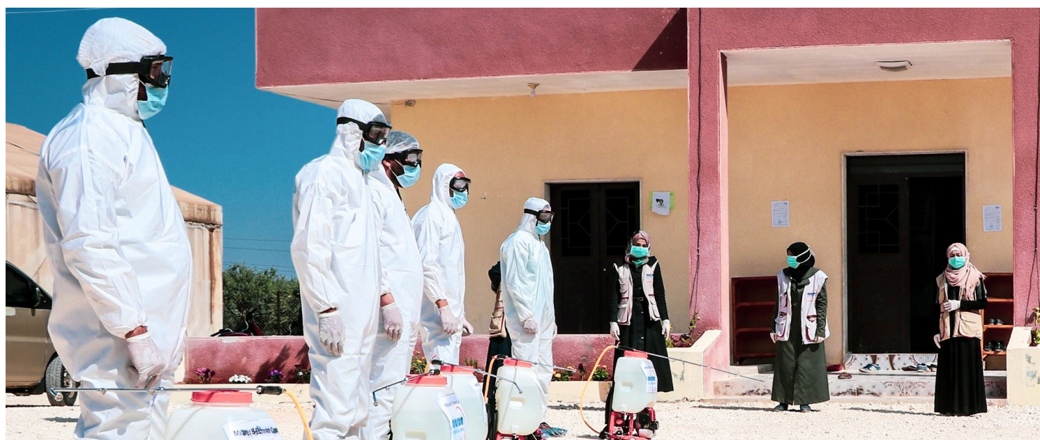
Covid-19 disinfection campaign led by IOM partners inside Syria