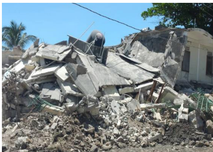
Collapsed house in Evede du Sud