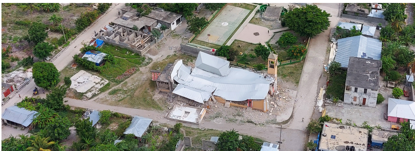
Collapsed church in Les Cayes