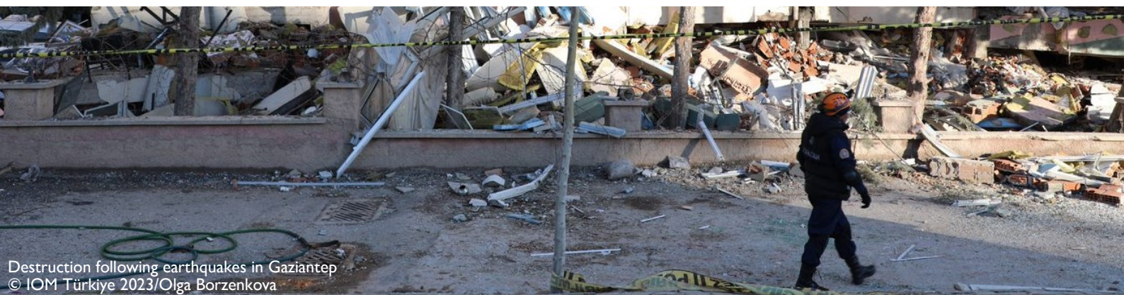
Destruction following earthquakes in Gaziantep