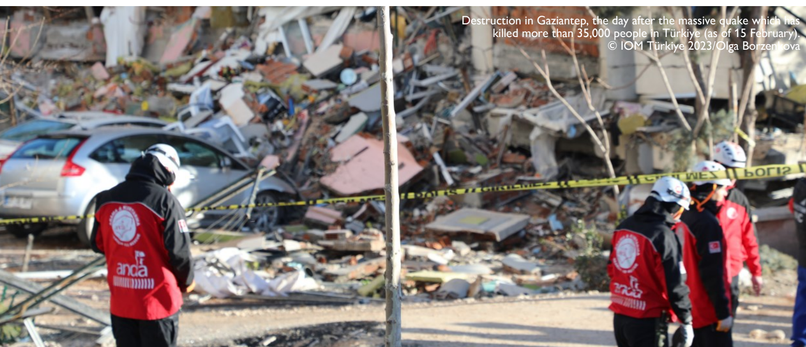
Destruction in Gaziantep, the day after the massive quake which has killed more than 35,000 people in Türkiye (as of 15 February).