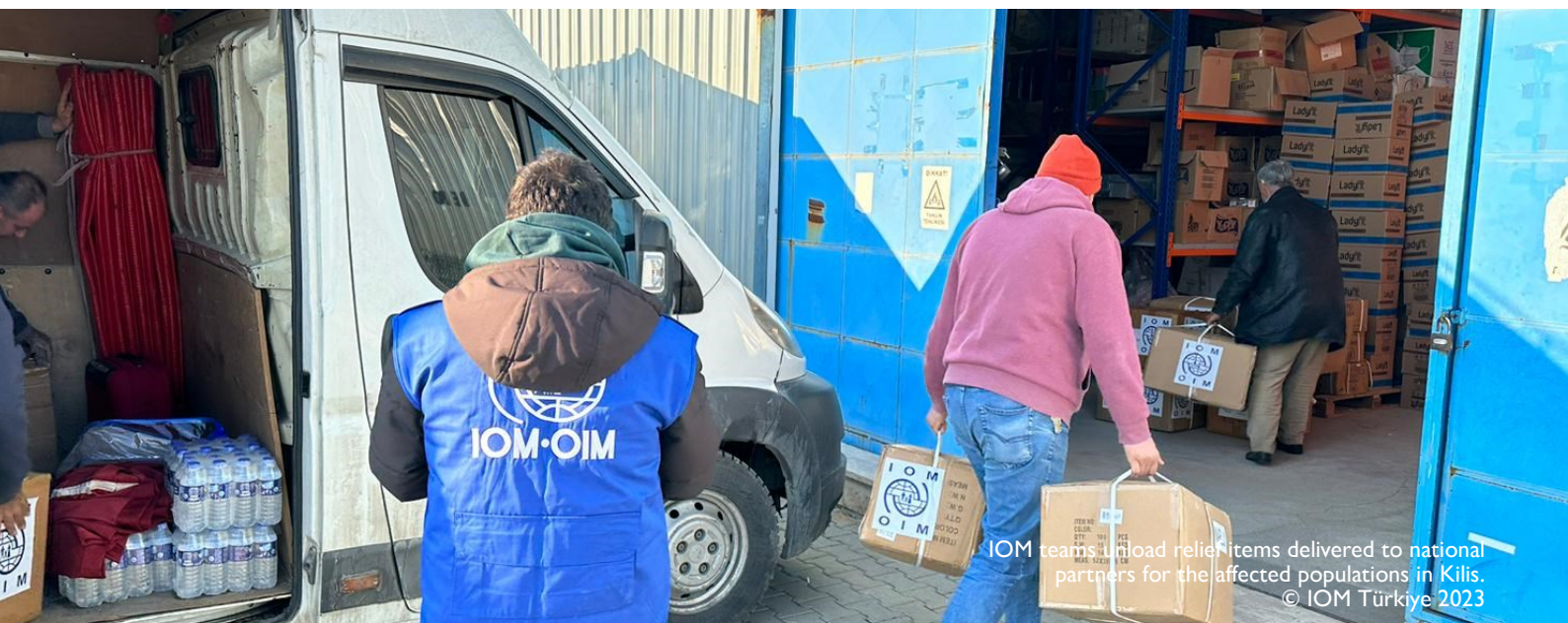
IOM teams unload relief items delivered to national partners for the affected populations in Kilis.