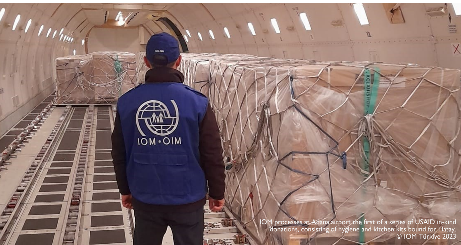
IOM processes at Adana airport the first of a series of USAID in-kind donations, consisting of hygiene and kitchen kits bound for Hatay.

IOM is a key member of interagency coordination efforts in Türkiye related to the crisis. Activities will be coordinated alongside actors on the ground to minimize the risk of duplication. IOM will work with a network of Turkish NGO partners, to ensure those most in need are reached with services, including in rural and remote areas.