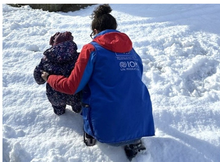
WINTER FUN IN TRC UŠIVAK.

IOM organizes various activities and sessions with beneficiaries to promote community involvement and increase awareness in all reception centres on a variety of topics. During the reporting period, a total of 12 community events were organized across four reception centres (4 sessions on the prevention of sexual exploitation and abuse, 2 creative and art sessions, 2 legal/info sessions, 2 sessions on mine risk education, 1 session with a focus on mental health, and 1 sport and play) for a total of 97 participants (81 M, 16 W).