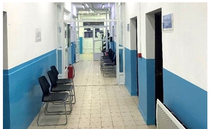
MEDICAL SCREENINGS AND CONSULTATIONS UNDER ONE ROOF IN TRC UŠIVAK.

Operating Procedures and Protocols to respond to common medical situations, ensuring an effective health response and referrals when medical teams are unavailable.