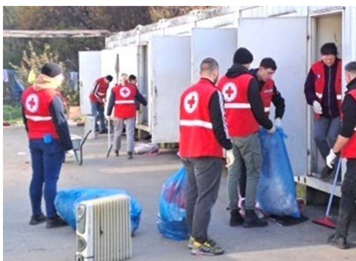
RED CROSS TEAM PREPARING ACCOMMODATION UNITS FOR NEW BENEFICIARIES IN TRC BLAŽUJ.

# of beneficiaries reached with info sessions: 780