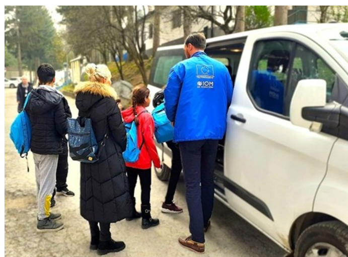
IOM MOBILE TEAMS PROVIDE TRANSPORTATION FOR SCHOOL CHILDREN.

# Assisted Voluntary Returns since 2018: 1,557 M: 1,374 F: 183