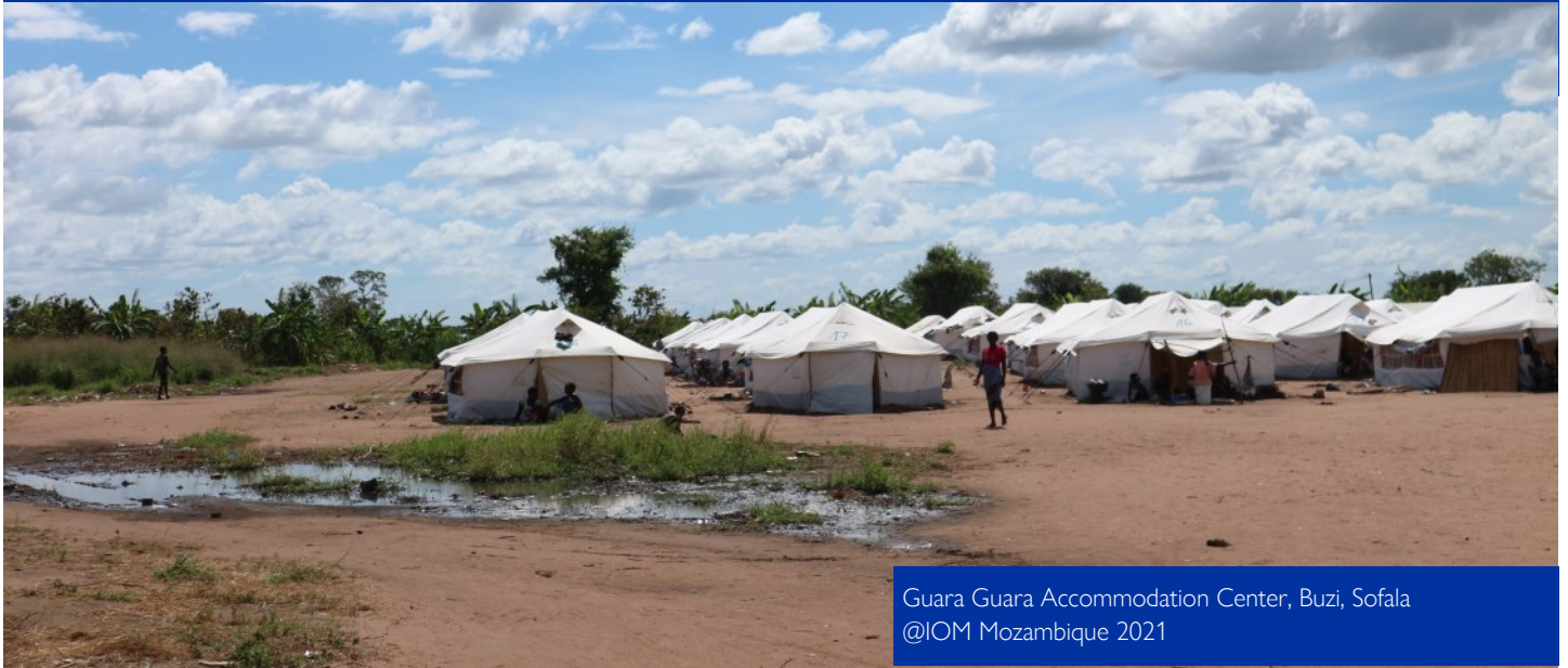
Guara Guara Accommodation Center, Buzi, Sofala