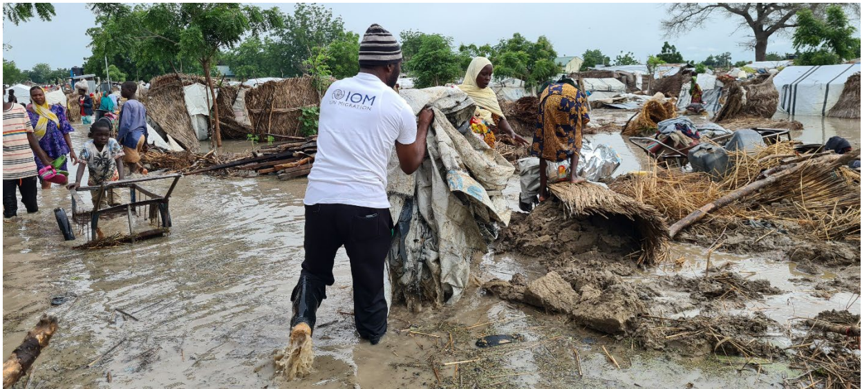
IOM staff teams conduct hygiene promotion for conflict-affected people in north-east Nigeria.

consistent, community first response mechanisms are reinforced, and strengthen collaboration and relations between sector partners, and Government of Nigeria focal points.