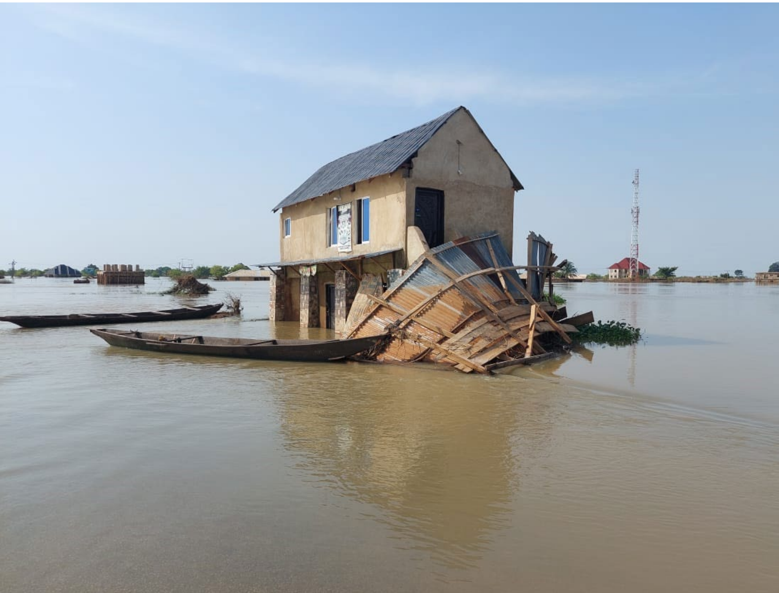
Flooded areas in Anambra.