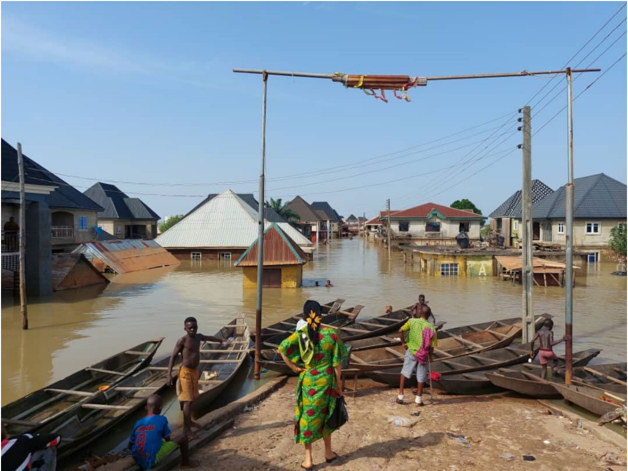
Flooded residential area in Anambra.