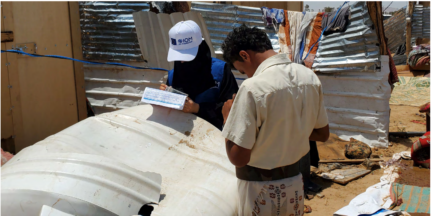
On-site assessments by IOM teams are crucial for determining the immediate needs and coordinating aid in the flood-stricken areas.

The interventions outlined in this flash appeal are in line and complementary to the 2024 Yemen Humanitarian Response Plan and country level contingency plans. As a member of the UN Country team in Yemen, IOM is working closely with UN agencies, local authorities and communities to ensure an effective and coordinated response. IOM will ensure this robust coordination with response actors including UN agencies, international and national organizations as well as authorities throughout implementation of all proposed activities.