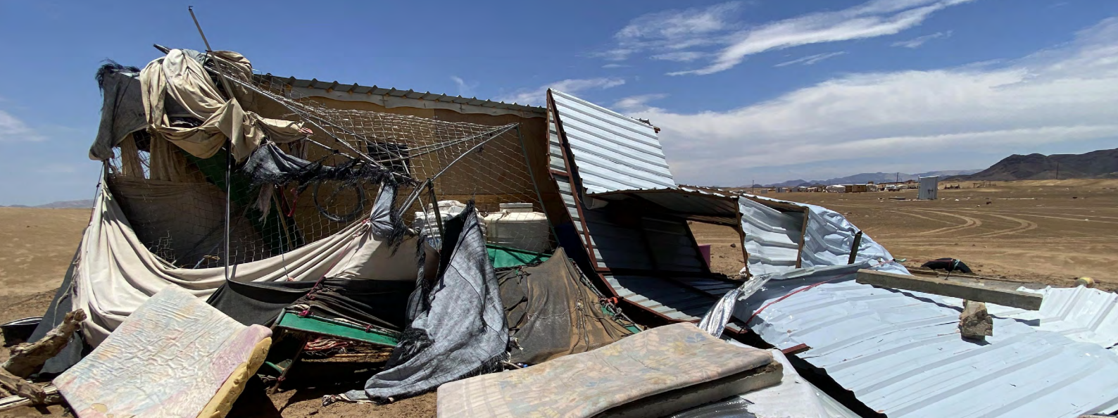
Heavy rains and winds hit Ma'rib hard, leaving a trail of destruction in their wake as families tried to salvage their belongings.