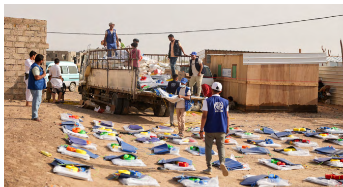
IOM teams distribute emergency shelter kits and essential supplies to flood-affected households in Ma'rib.

Although the majority are IDPs, at least 50 migrant households have also been impacted. These households are in need of multisectoral assistance as essential belongings have been blown away and lost. Further assistance is needed to repair the widespread damage to sanitation infrastructure and address urgent and growing health needs.