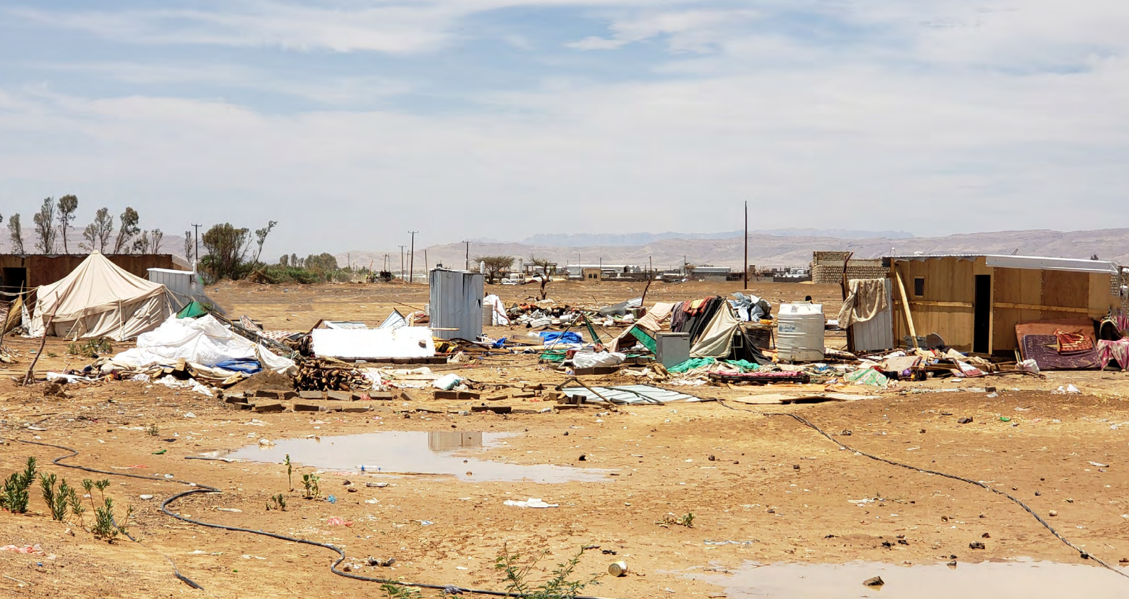
Floods have torn through neighborhoods, leaving families struggling amidst the wreckage.