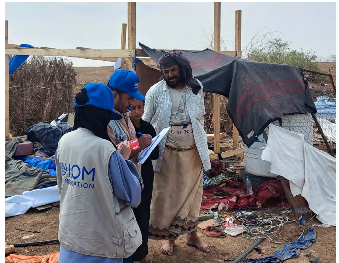
IOM is on the ground providing urgent support to affected families, but the scale of the devastation underscores the critical need for continued resources.

Torrential rains and flash flooding began in early August, hitting Ta'iz and Al Hodeidah governorates along Yemen's West Coast. In Al Hodeidah, all 26 districts have been affected, where according to the CCCM cluster, more than 9,000 families have been impacted. According to OCHA, a total of 36 deaths and 564 injuries have so far been reported. In Ta'iz, more than 5,100 families have borne the brunt of flooding. The heavy rains have resulted in significant damage to shelters, water sources and public infrastructure leading to electrical shortages, impacting livelihoods, along with loss of personal belongings and loss of essential medical supplies and equipment. In Al Hodeidah (Al Khukhah and At Tuhayta districts) the multisectoral needs assessments identified at least 700 households impacted by flooding, while in Ta'iz (Ash Shamayatayn and Al Ma'afer district) IOM estimates at least 850 households are in need of assistance across IOM-managed sites.