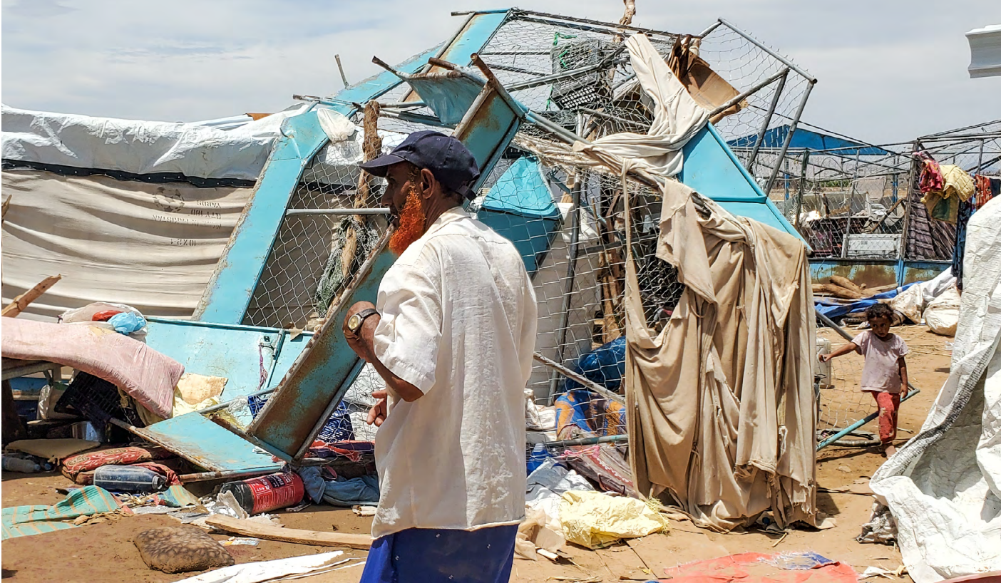
Strong winds in Ma'rib have devastated thousands of shelters, displacing families and damaging critical infrastructure.