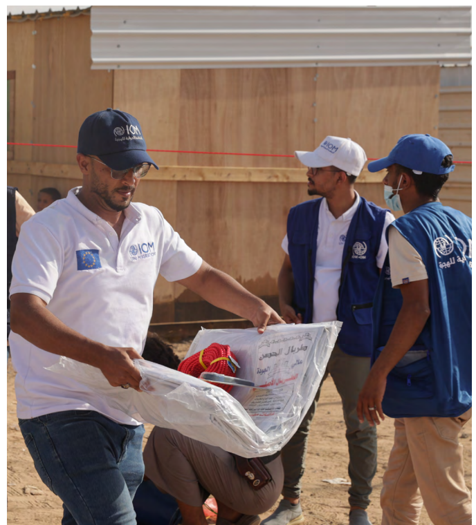
IOM is offering crucial assistance to families whose shelters have been severely damaged, helping them to recover and rebuild.

The Organization also serves as the sub-national cluster lead for WASH, co-lead of the Rapid Response Mechanism sector, technical lead of the Cash Consortium of Yemen and lead of the Refugee & Migrants Multi-Sector. IOM continues to be a key health actor, currently supporting 20 health facilities and eight mobile medical teams throughout the country. During the 2023 flood season, in Ma'rib alone, IOM reached more than 114,000 individuals across 31 sites with emergency assistance and risk reduction works. Similar support was provided to at-risk and impacted households in Ibb, Ta'iz and Al Hodeidah.