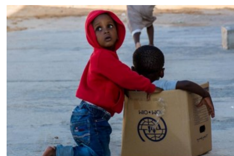
VHR AND REINTEGRATION PROJECT—ITALIAN MFA