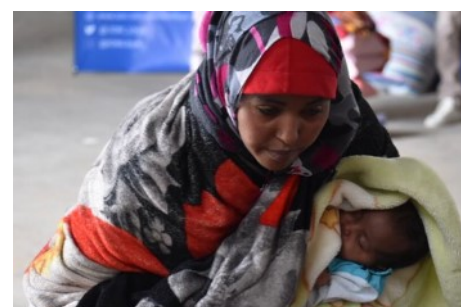
SEARCH AND RESCUE PROJECT—UK DFID