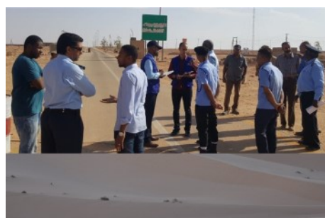
BORDER MANAGEMENT PROJECT—GOV. OF JAPAN