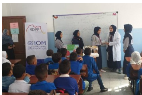
COMMUNITY RESILIENCE INITIATIVE—EU RDPP