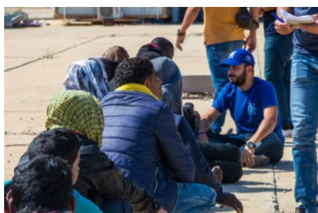
NOAH PHASE V PROJECT—PRM