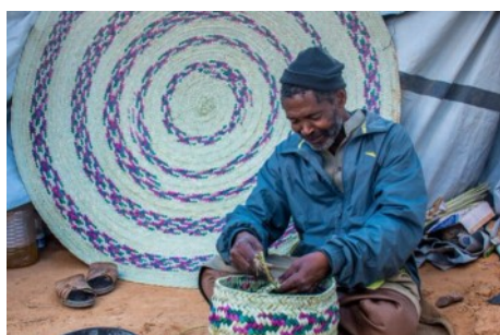
MHPSS, TAWERGHA IDPS—GOV. OF CANADA