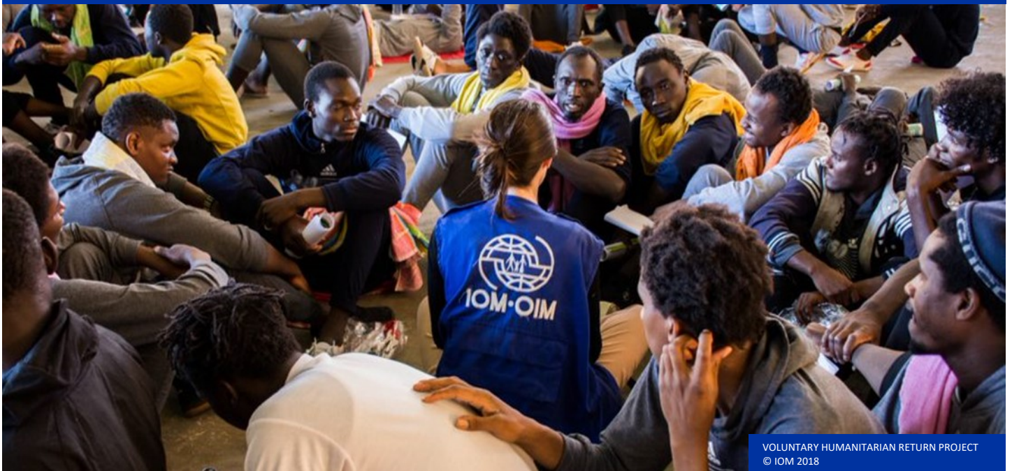
VOLUNTARY HUMANITARIAN RETURN PROJECT