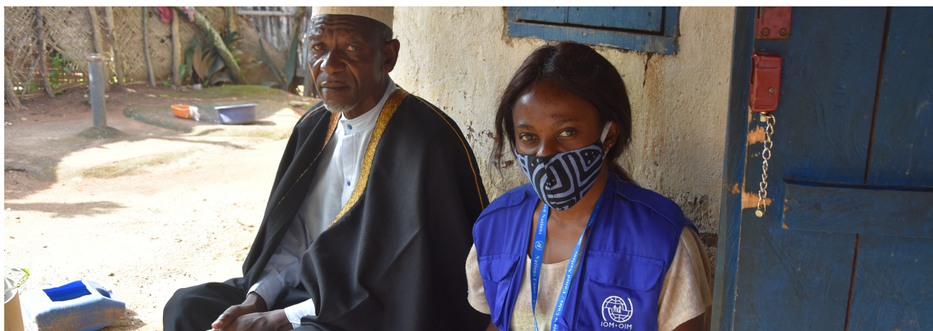
IOM Staff Speak to Community Members During Monitoring Visit, East Region, Cameroon.