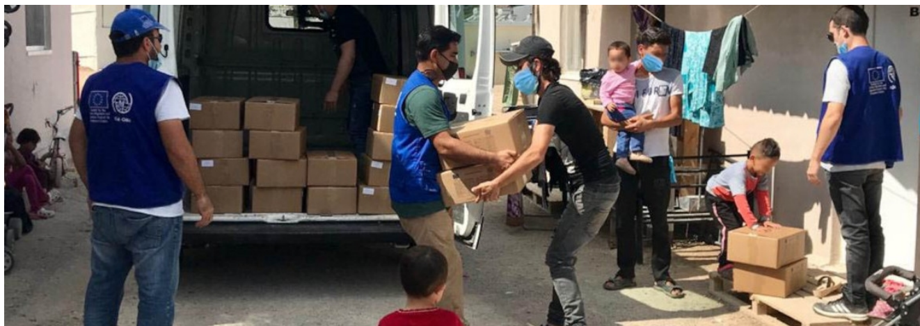
IOM Greece staff coordinate the distribution of personal protective equipment including masks, gloves and cleaning kits, ensuring the protection and well-being of migrant populations during the COVID-19 response