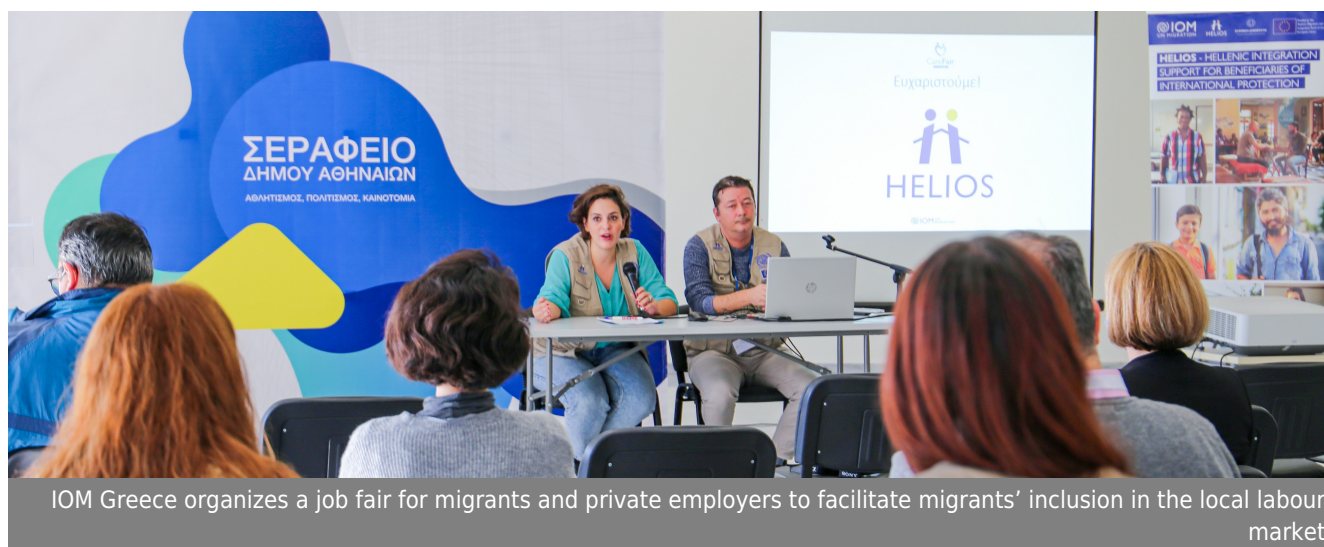
IOM Greece organizes a job fair for migrants and private employers to facilitate migrants' inclusion in the local labour market