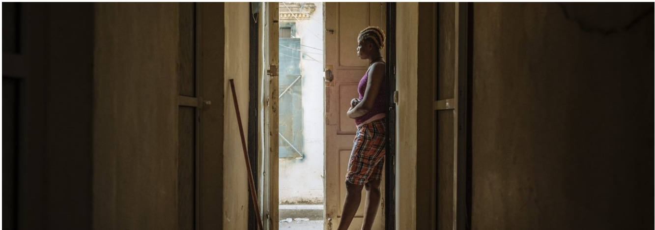
A female migrant worker stands by her doorway in Beirut