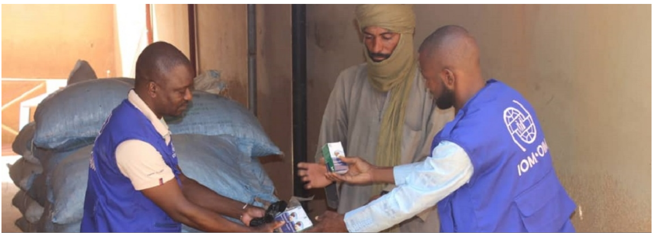
Distribution of livelihood kits in Timbuktu