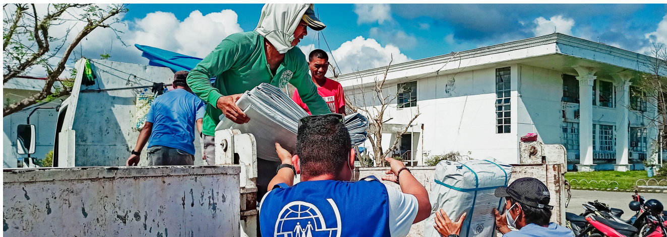
Super Typhoon Goni emergency response in Catanduanes, Bicol Region