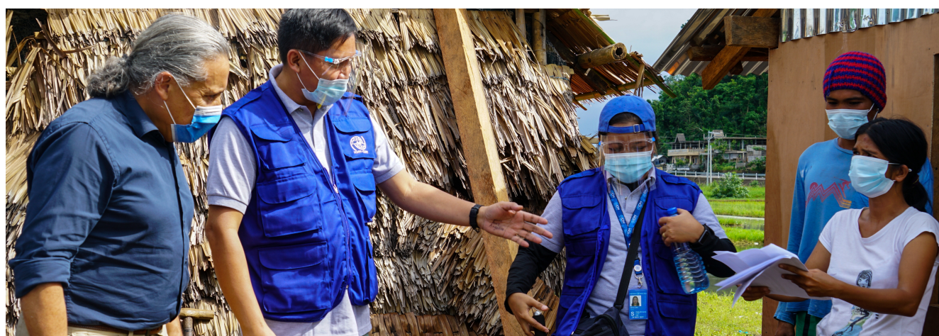
Super Typhoon Goni emergency response in Albay, Bicol Region