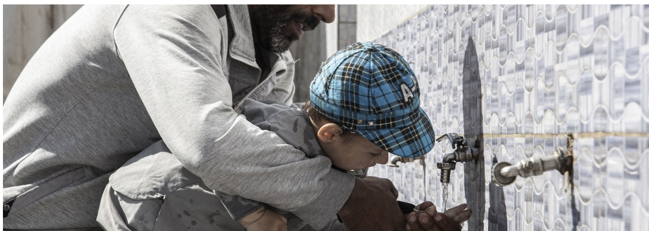
Man helps boy wash his hands in displacement site, Syria.