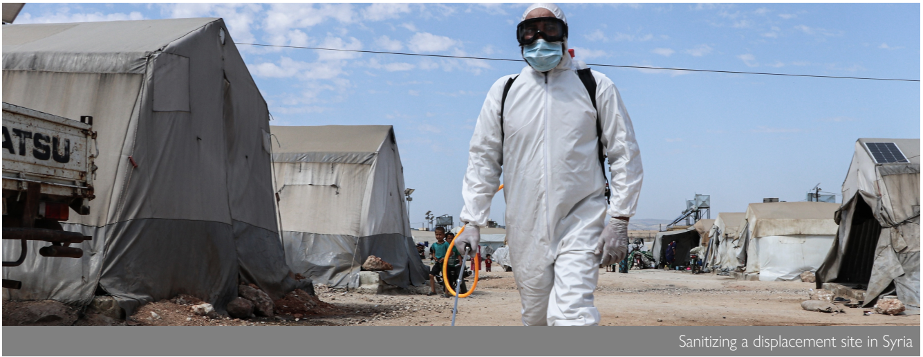
Sanitizing a displacement site in Syria