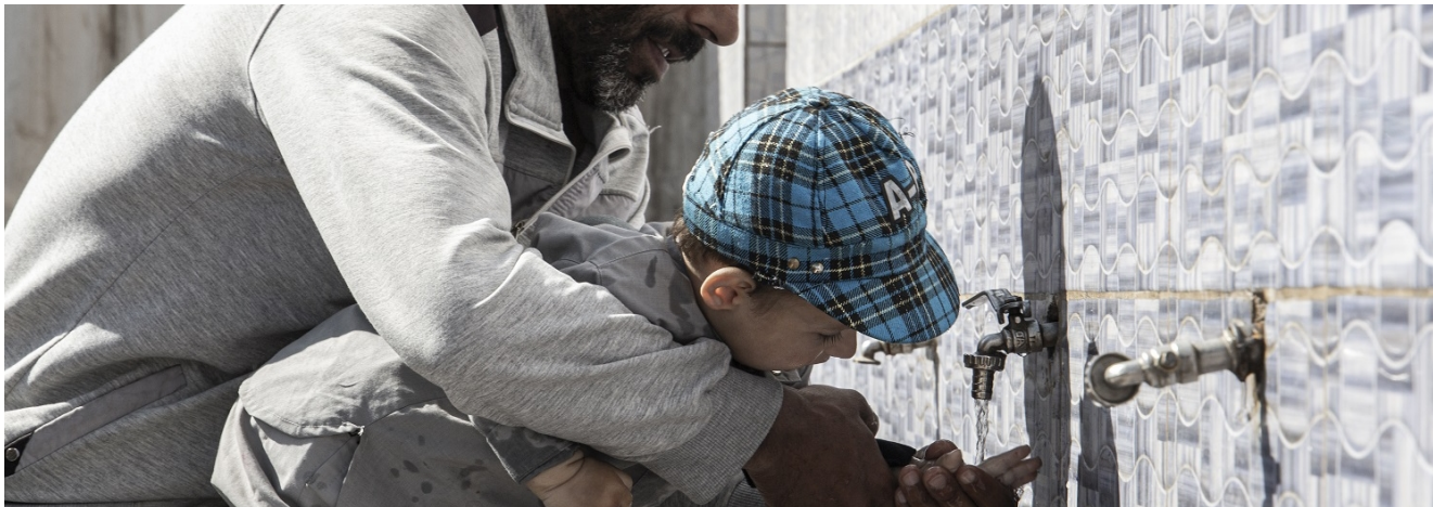
Man helps boy wash his hands in displacement site, Syria.