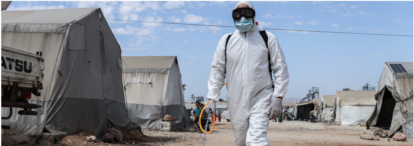
Sanitizing a displacement site in Syria