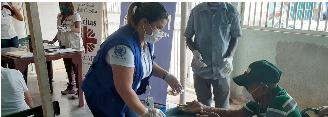
Informative session on the hygiene kits delivered in the La Trinitarias community, Maracaibo municipality, Zulia state, Venezuela.