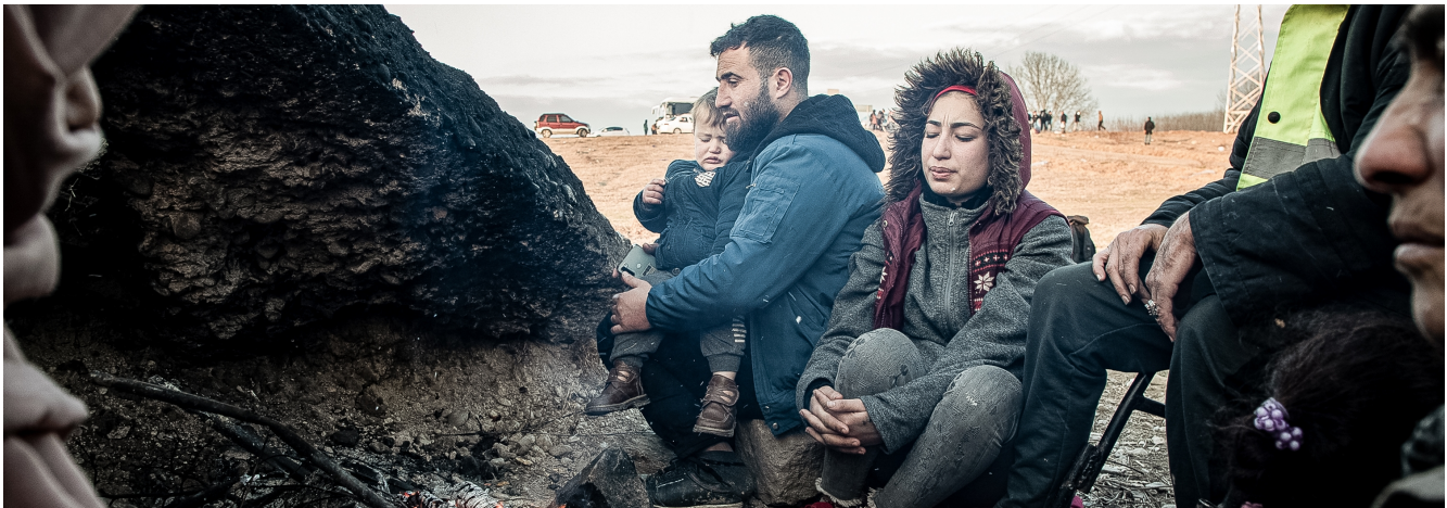
A Syrian family huddles by a fire at the Edirne border