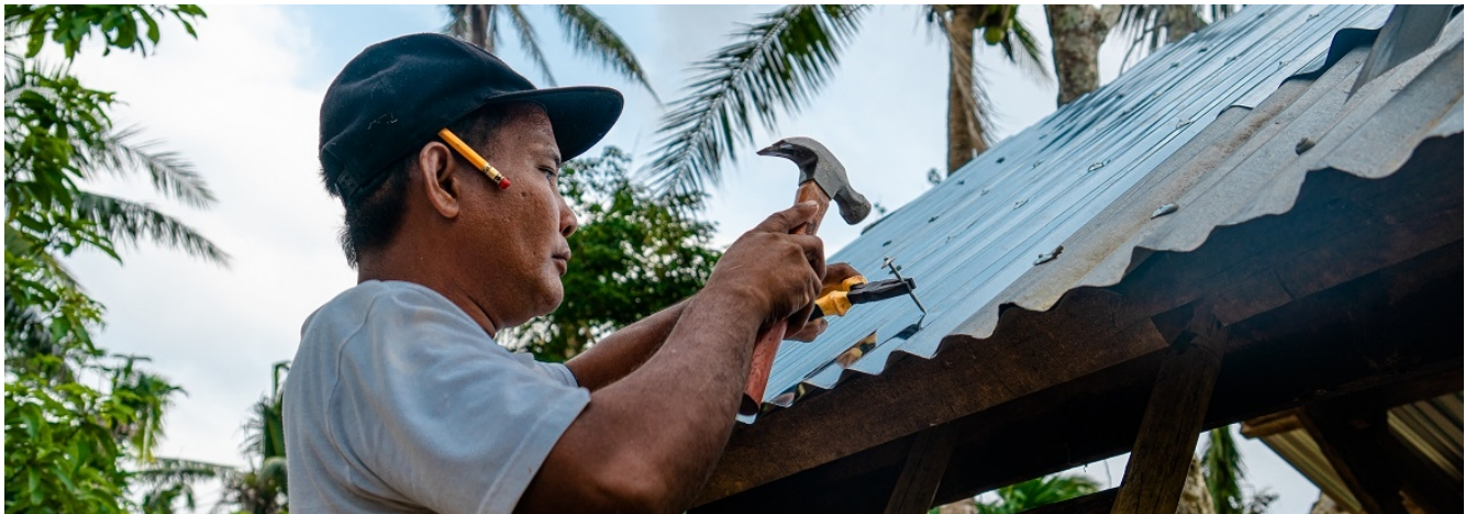
A person affected by Super Typhoon Gooni is using the shelter kit distributed by IOM to repair his shelter in Bicol, Philippines.