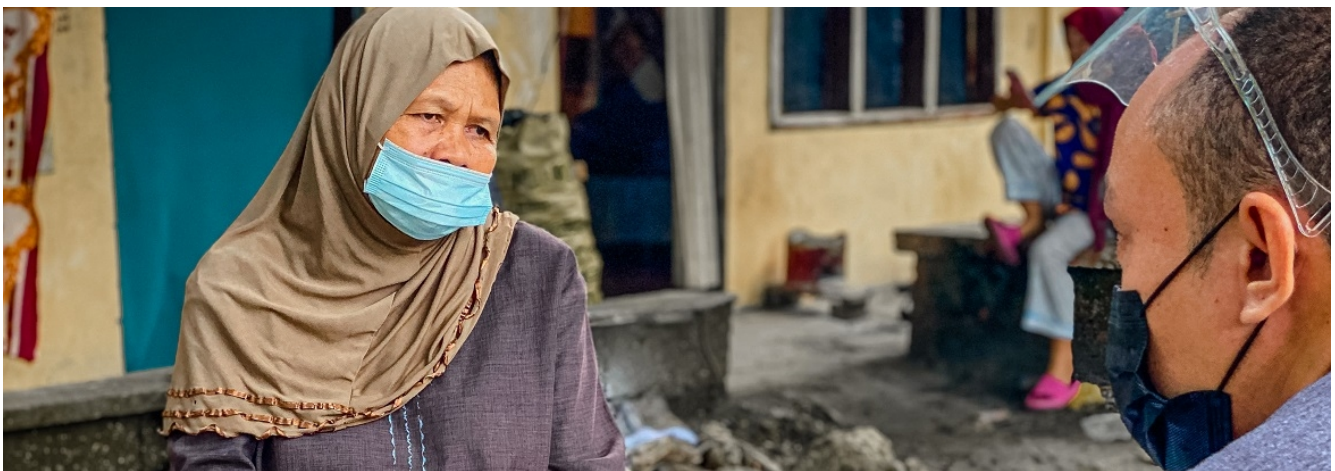
An IOM DTM staff is collecting information from a woman displaced from Mindanao.

ADDRESS THE DRIVERS AND LONGER TERM IMPACTS OF CRISES AND DISPLACEMENT THROUGH INVESTMENTS IN RECOVERY AND CRISIS PREVENTION