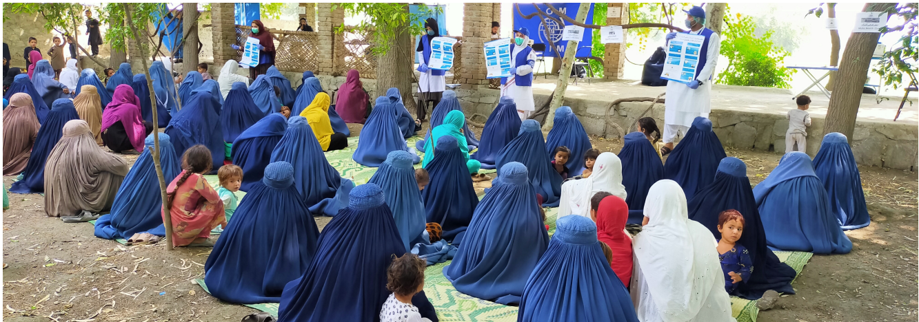
IOM's mobile health teams provide life-saving health services and information on COVID-19