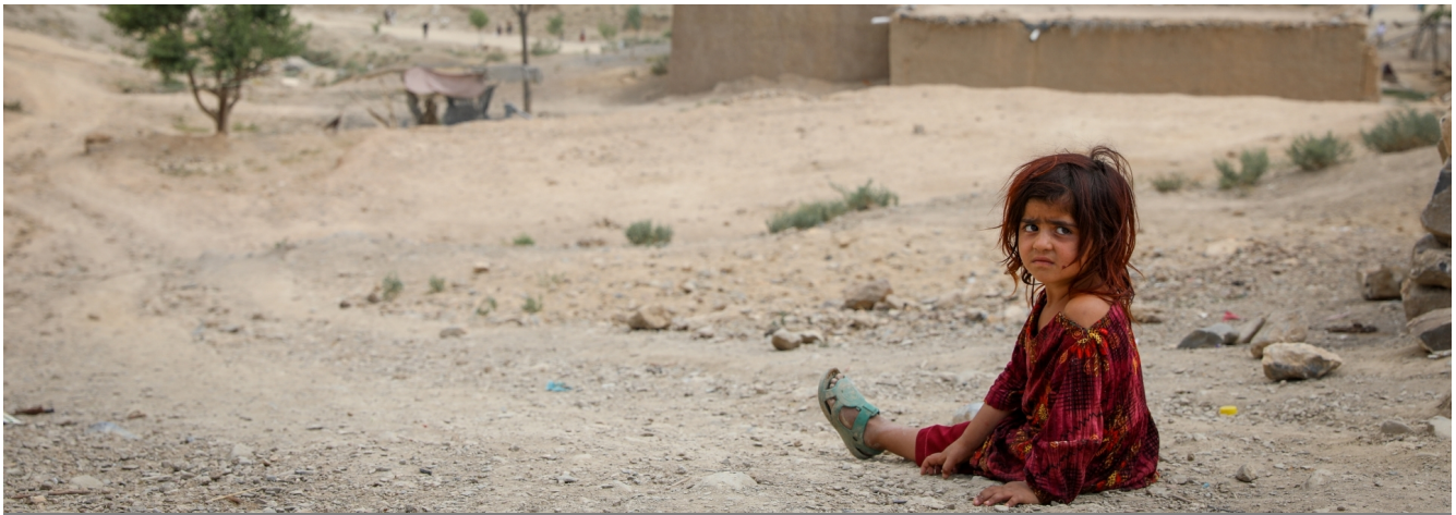
Afghan girl sitting near the Barmal earthquake response shelter