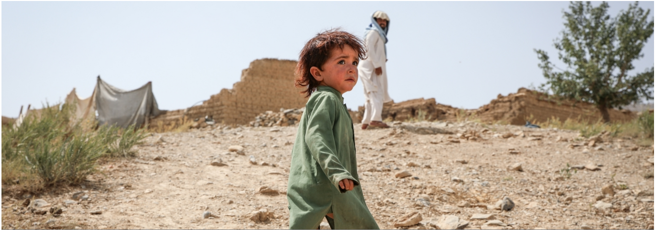
An earthquake survivor from Barmal