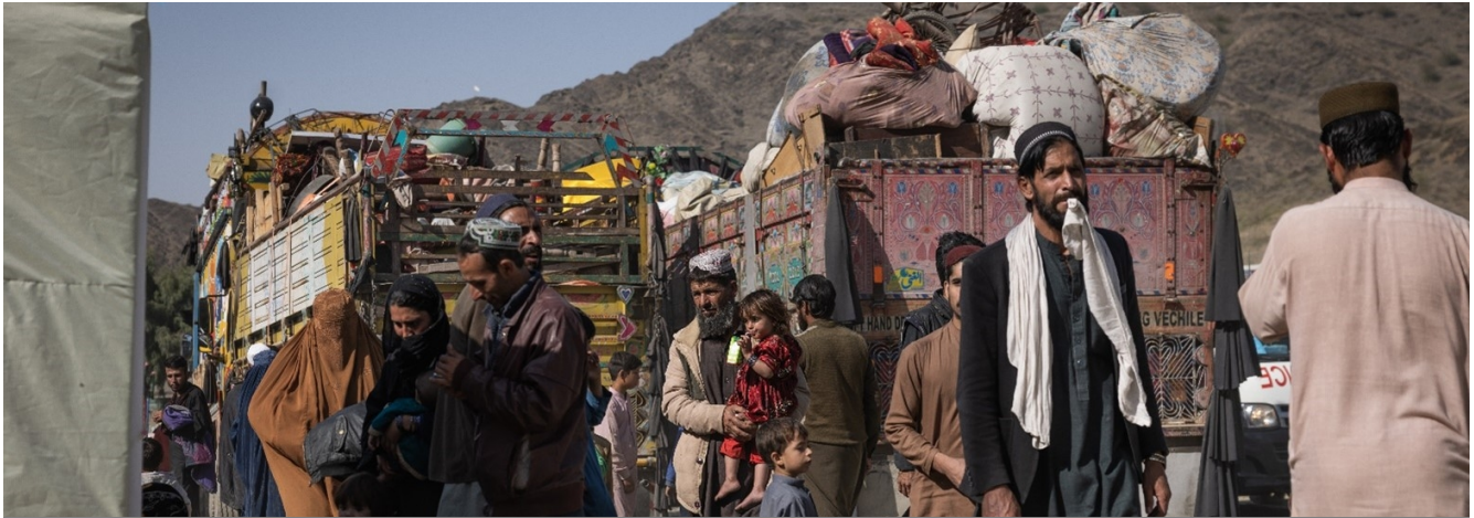
Afghan returnees in Torkham following the Government of Pakistan's announcement of the 'Illegal Foreigners Deportation Plan'.