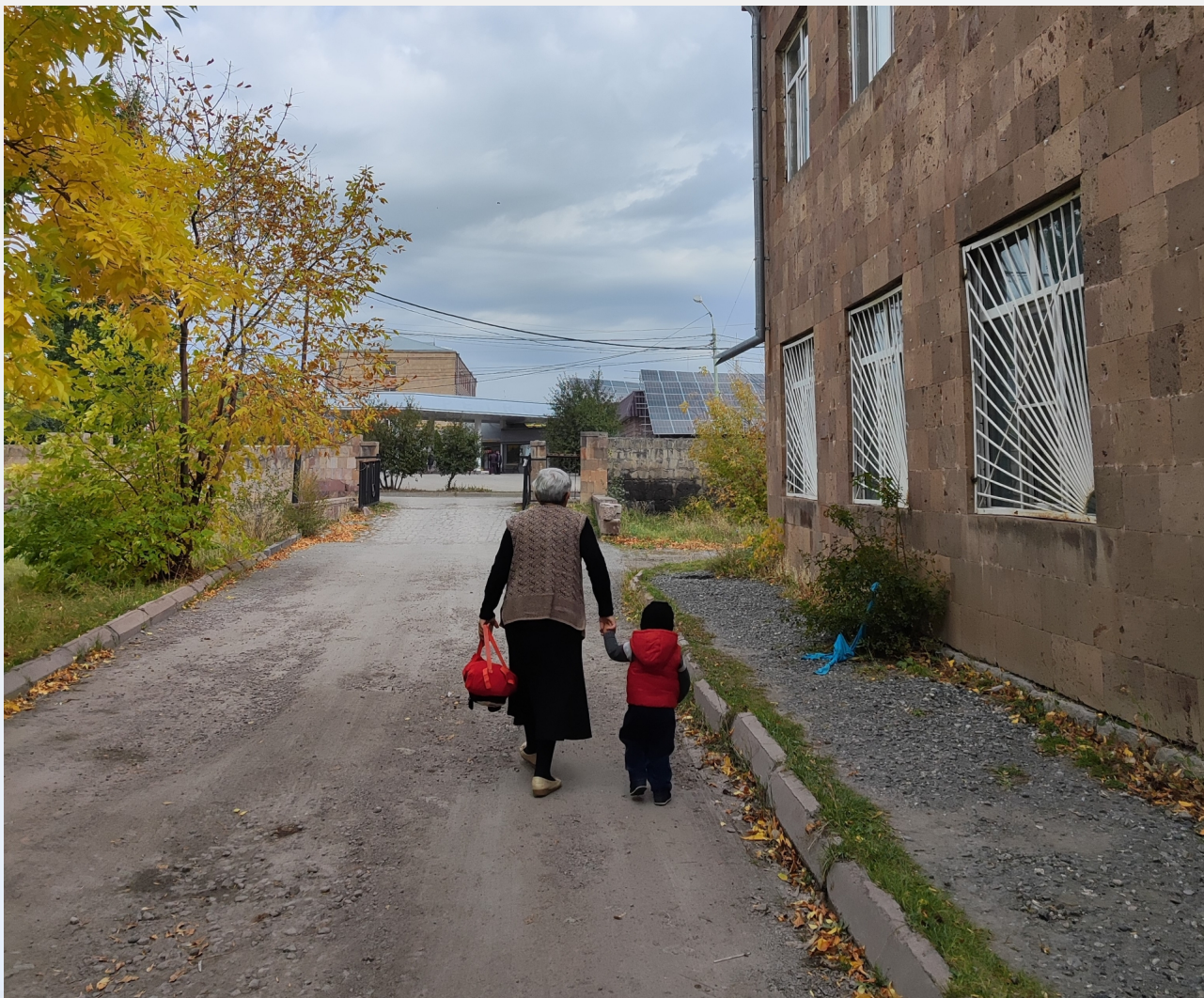
Another day at a collective shelter for refugees in a disused hospital of Gyumri.