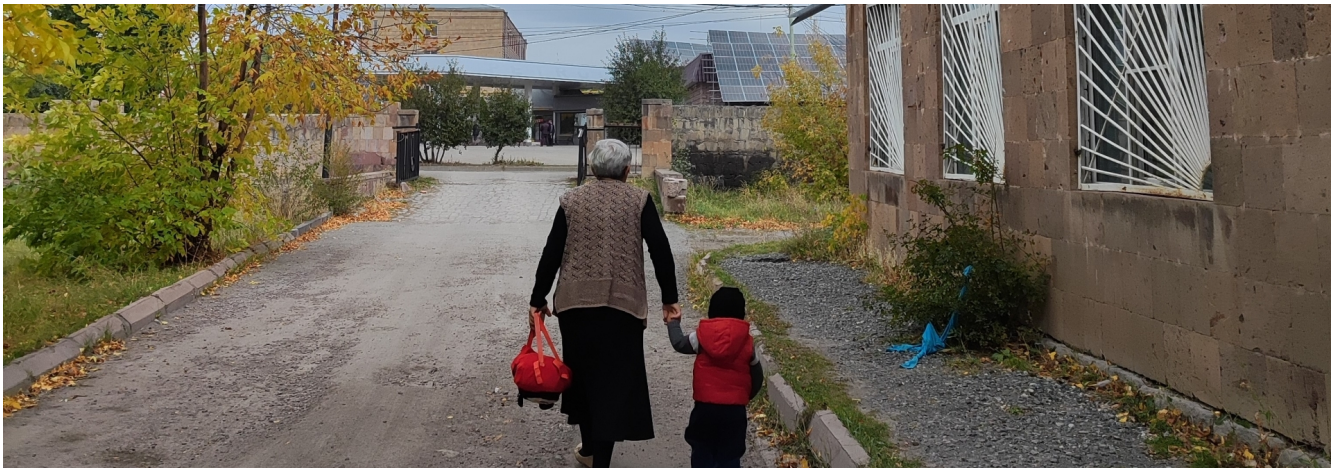
Another day at a collective shelter for refugees in a disused hospital of Gyumri.