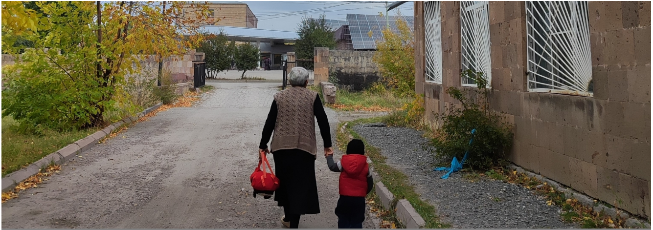
Another day at a collective shelter for refugees in a disused hospital of Gyumri.