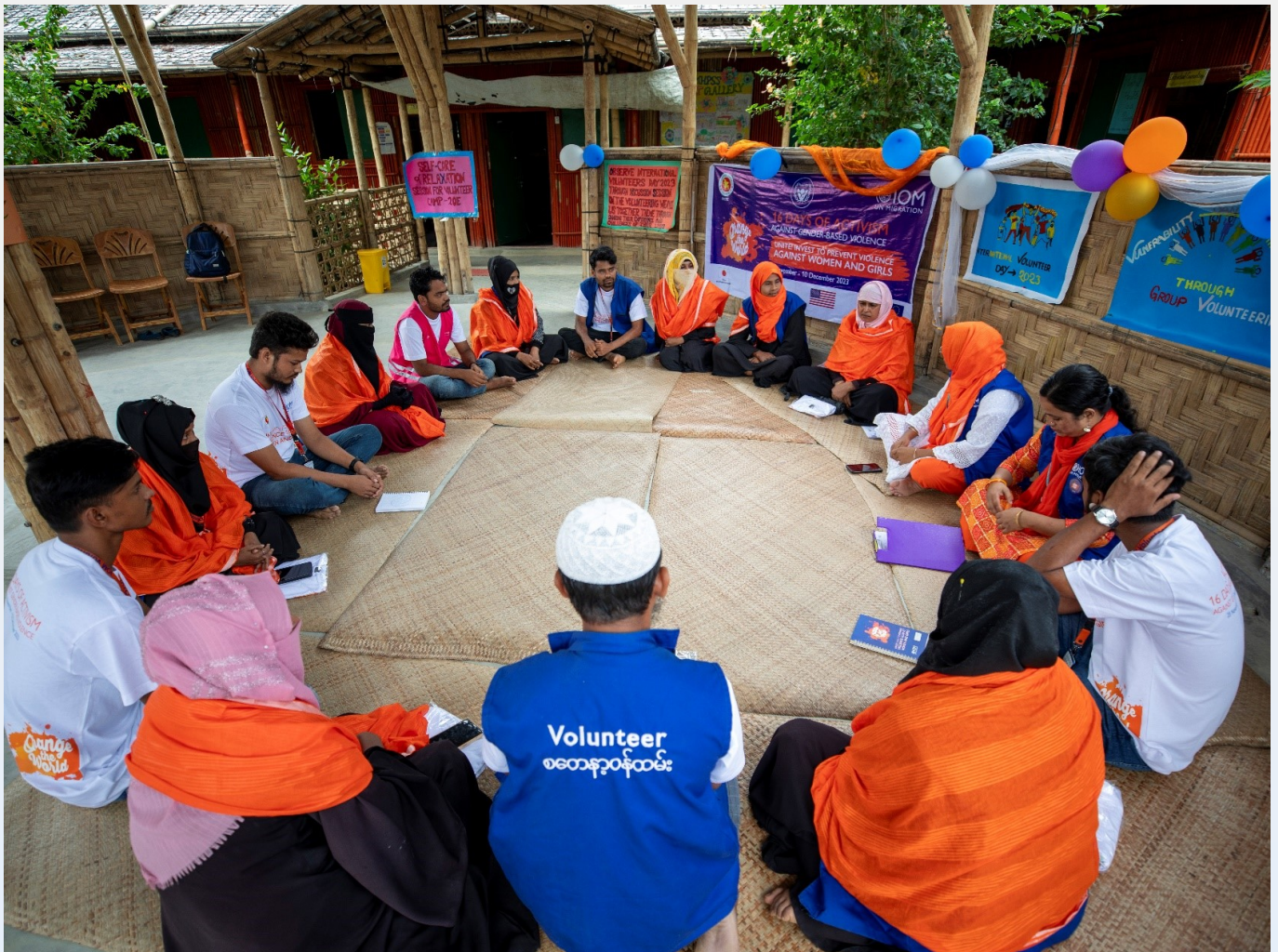
Protection mainstreaming session during the 16 Days of Activism.