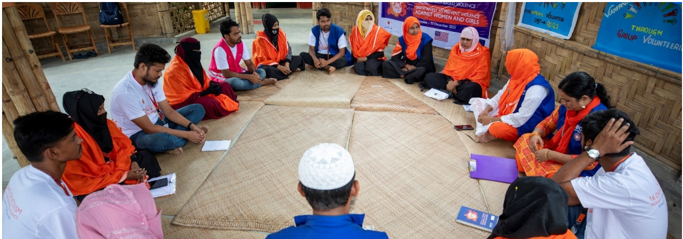
Protection mainstreaming session during the 16 Days of Activism.