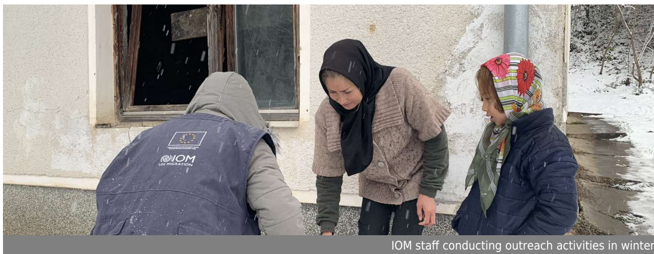
IOM staff conducting outreach activities in winter