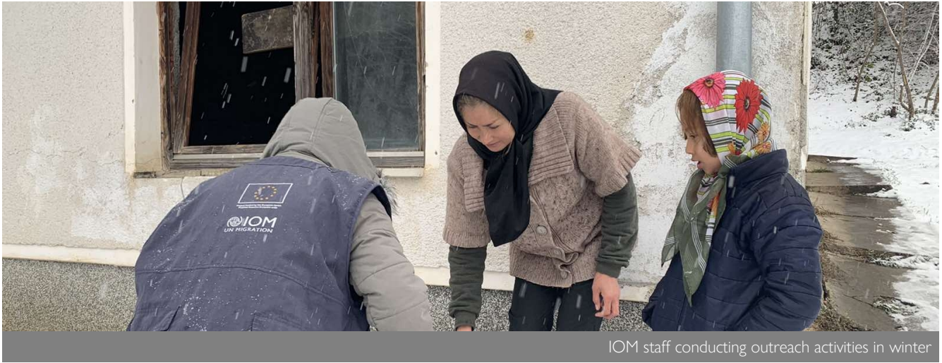
IOM staff conducting outreach activities in winter