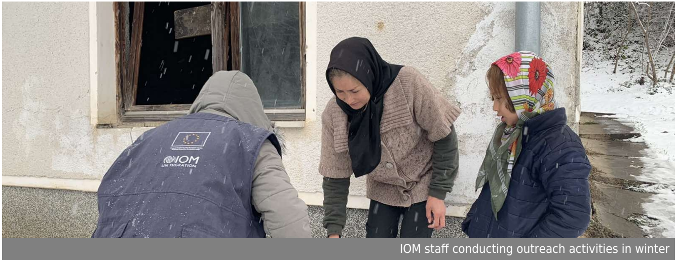
IOM staff conducting outreach activities in winter