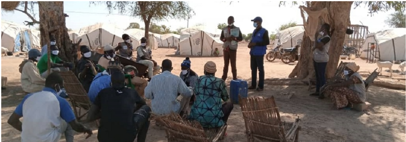
MHPSS activities in a displacement site