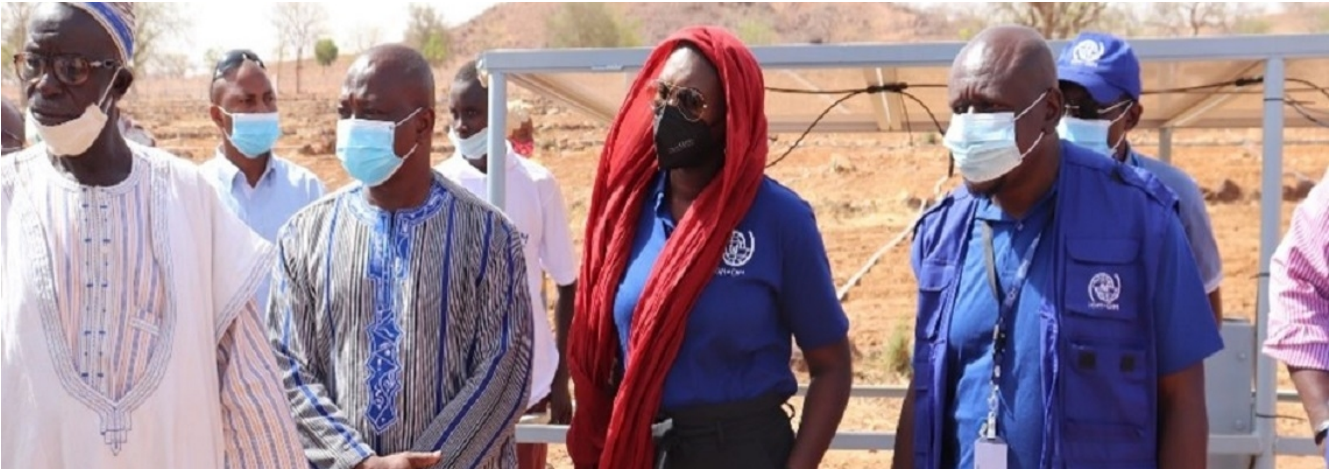
IOM Burkina Faso Chief of Mission discusses with local authorities and beneficiaries at handover ceremony of livelihoods activities, April 2021.