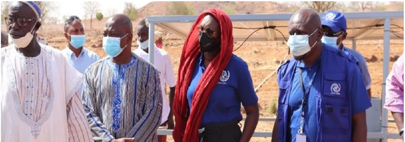
IOM Burkina Faso Chief of Mission discusses with local authorities and beneficiaries at handover ceremony of livelihoods activities, April 2021.