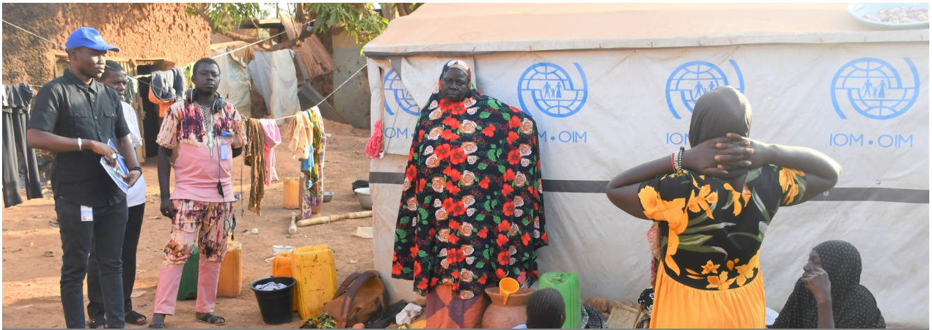
Internally displaced persons and refugees benefited from housing integrated into the host community.