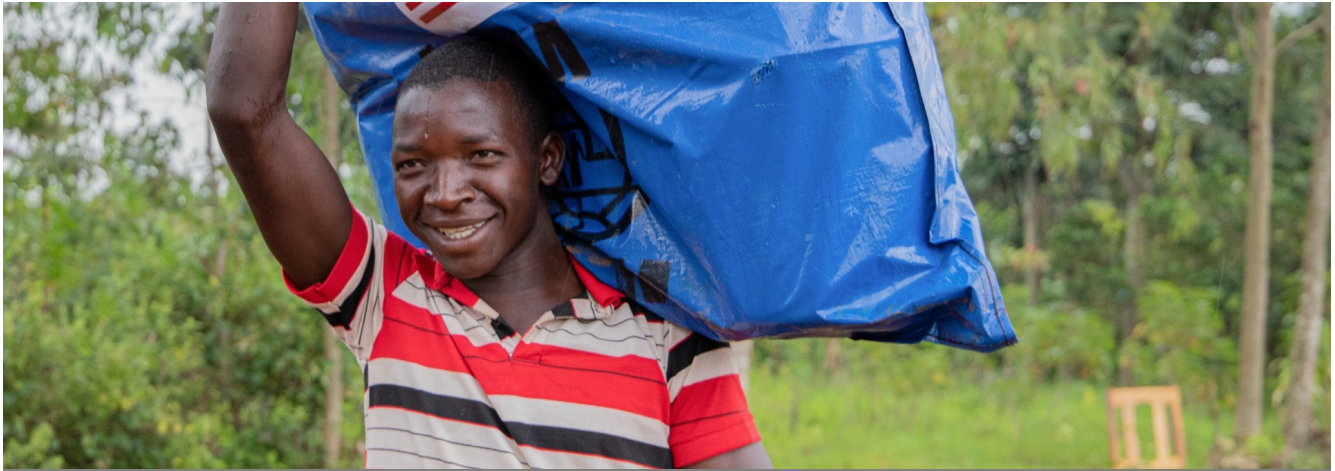
NFI distribution in Ruyigi province to households affected by climate-induced disasters