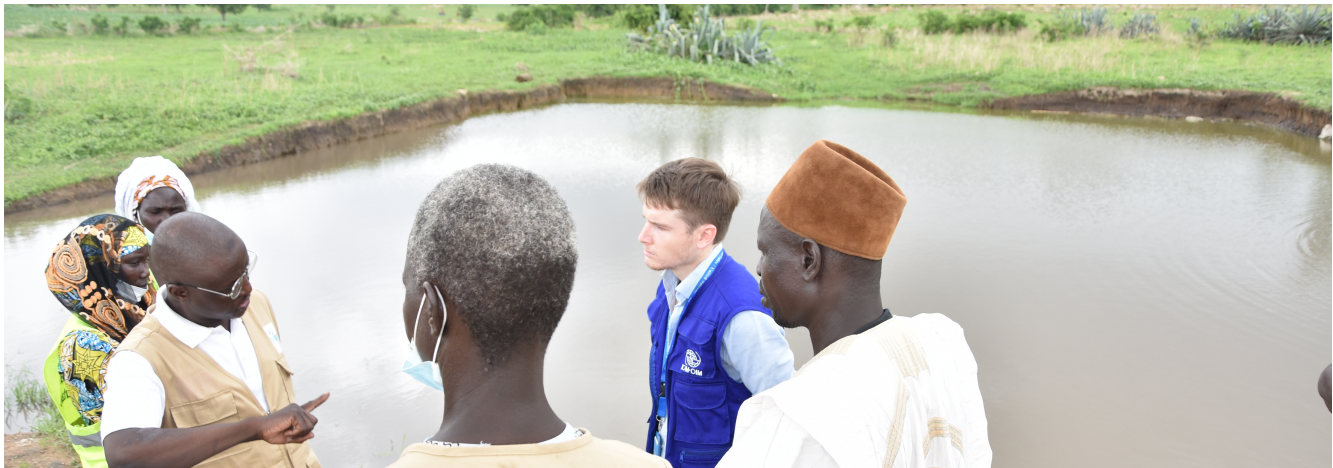
IOM Staff Speak to Community Members During Post Monitoring Visit, Far-North Region, Cameroon.