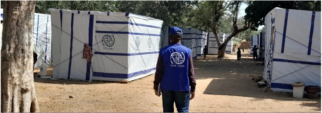
Construction of emergency shelters at the Grédé IDP site, Mokolo (Mayo Tsanaga).