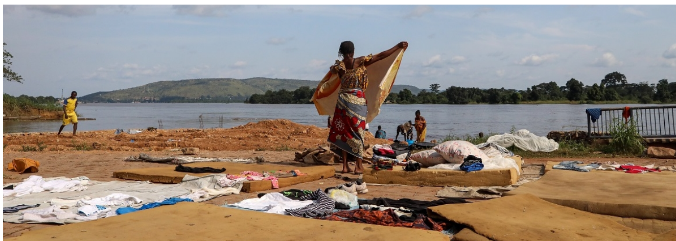
Flood assistance by IOM CAR