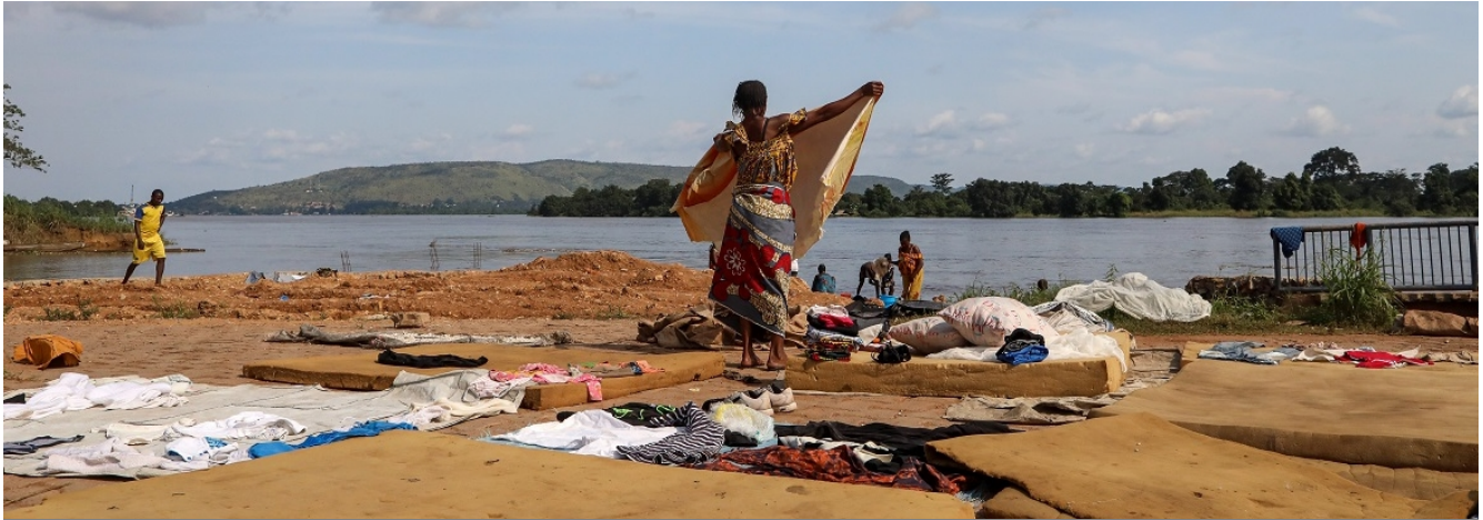
Flood assistance by IOM CAR