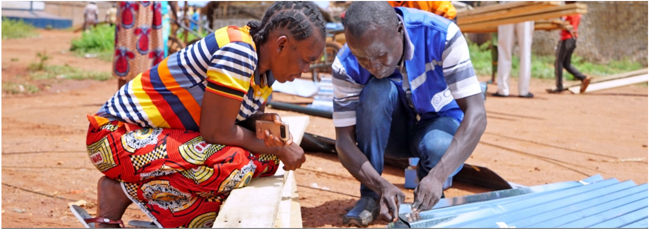
IOM constructs shelters for displaced populations in Bria, Haute-Kotto, CAR