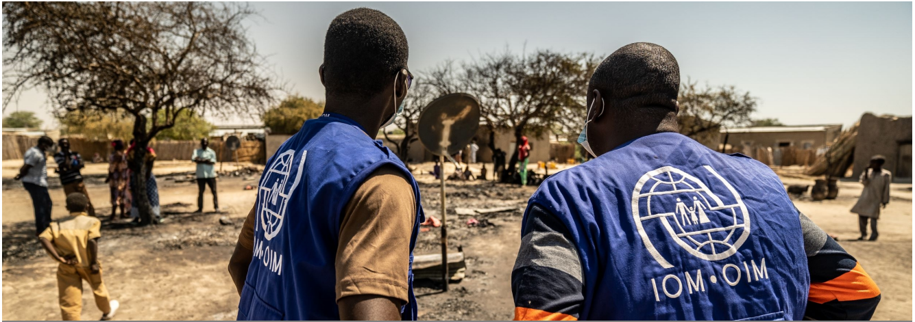
NFI distribution in the Lac province, September 2022.