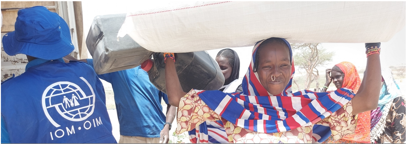
NFI distribution in the Lac province to assist people affected by floods © IOM Chad/February 2023