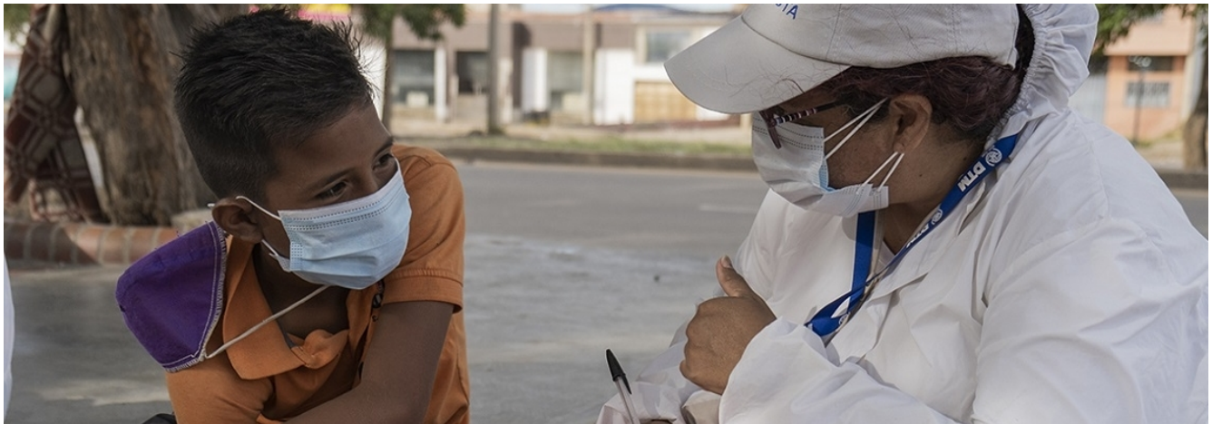
DTM staff conduct a survey with children from Venezuela municipality of Cúcuta, to characterise, analyse and provide a better understanding of their needs.