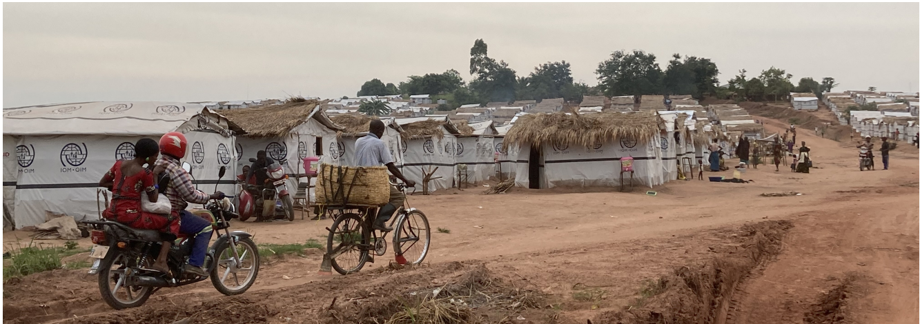
Likasi displacement site, Kalemie, Tanganyika province, © IOM 2020, Daco Tambikila