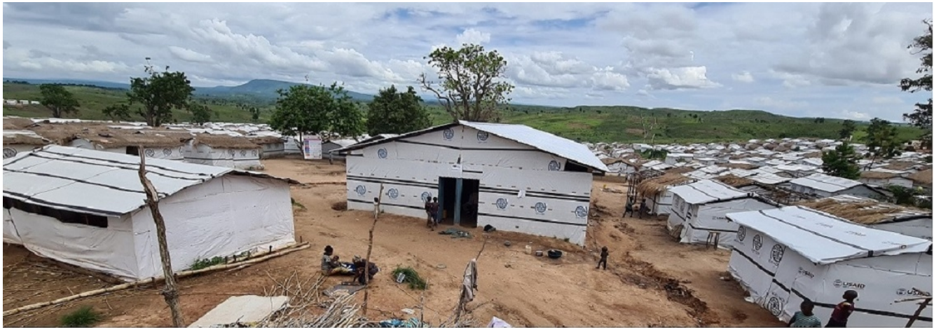
Emergency shelter in the Likasi displacement site; territory of Kalemie (Tanganyika).