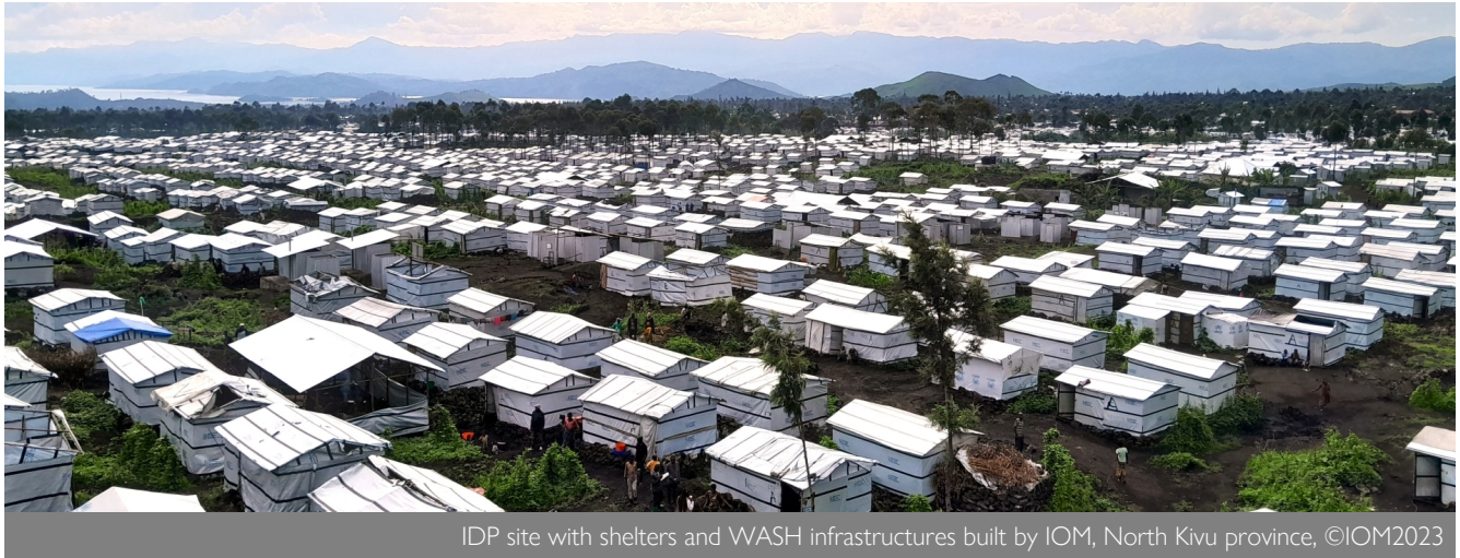
IDP site with shelters and WASH infrastructures built by IOM, North Kivu province