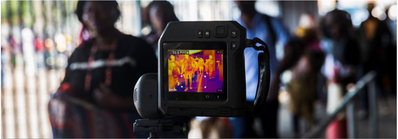
Health screening at the Petite Barrière Point of Entry, one of two border points connecting the densely populated city of Goma in the Democratic Republic of the Congo with Rwanda.