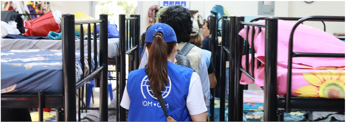
Collective center assessment in response to Tropical Storm Julia.