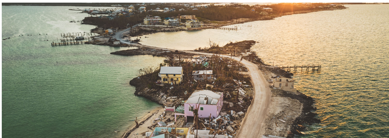
Bahamas Abaco island hit by Hurricane Dorian in 2019