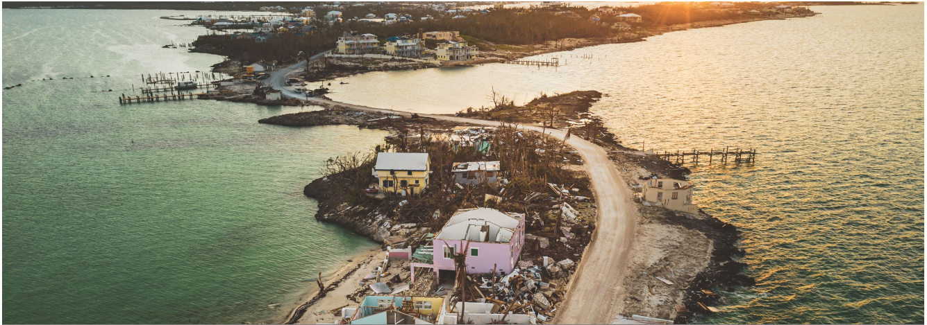
Bahamas Abaco island hit by Hurricane Dorian in 2019