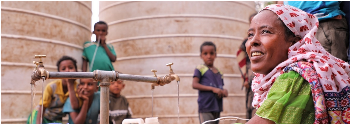
IDPs receiving safe and clean water through water trucking support in Shire/Tigray.