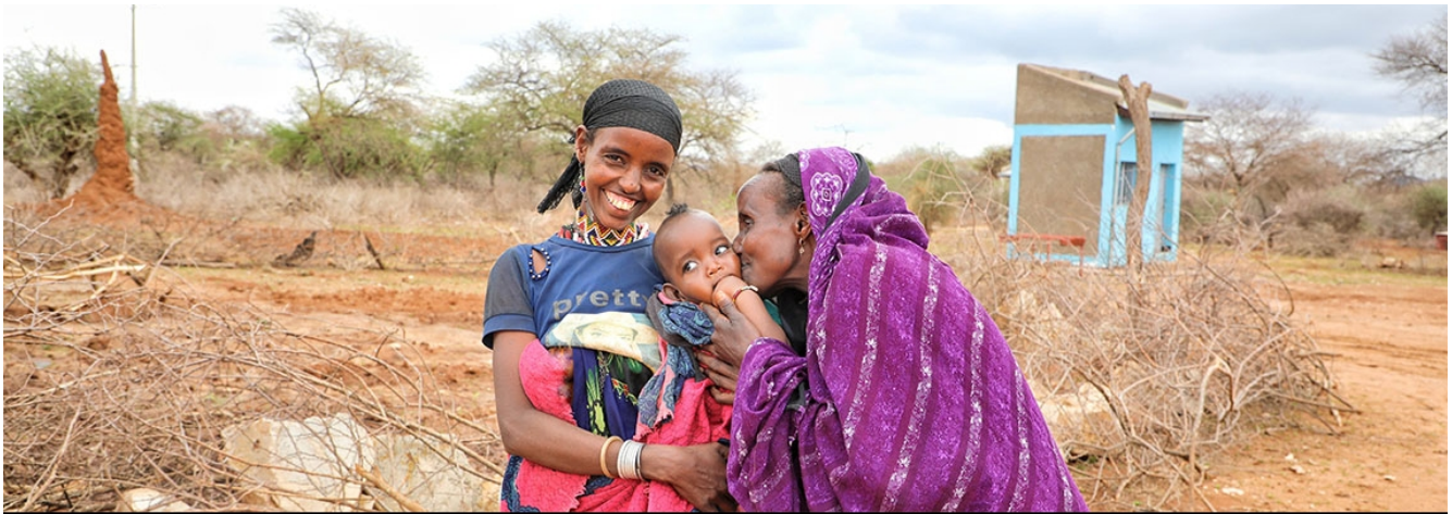
Drought response in Hiyas, Afar Region.