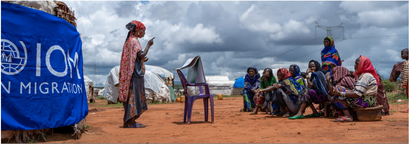
A hygiene promoter sharing information to drought-displaced communities in Ethiopia.