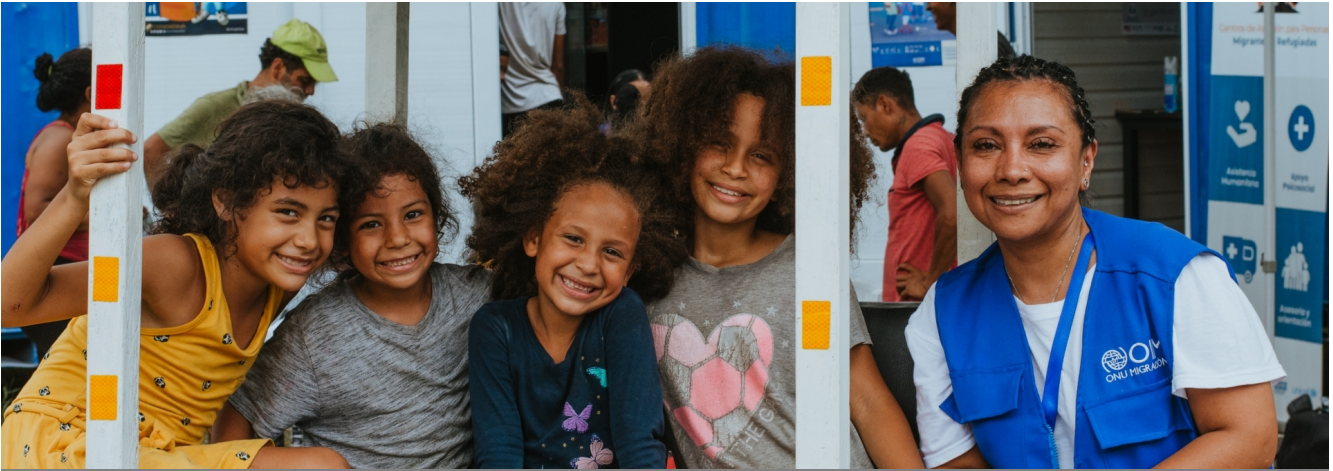
Beneficiaries at the Migration Response Centre in Tecun Uman, Guatemala.