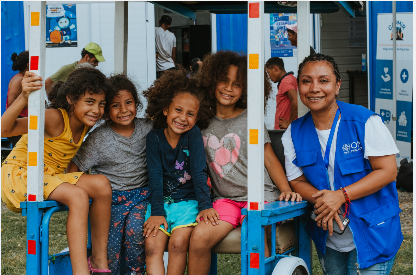
Beneficiaries at the Migration Response Centre in Tecun Uman, Guatemala.