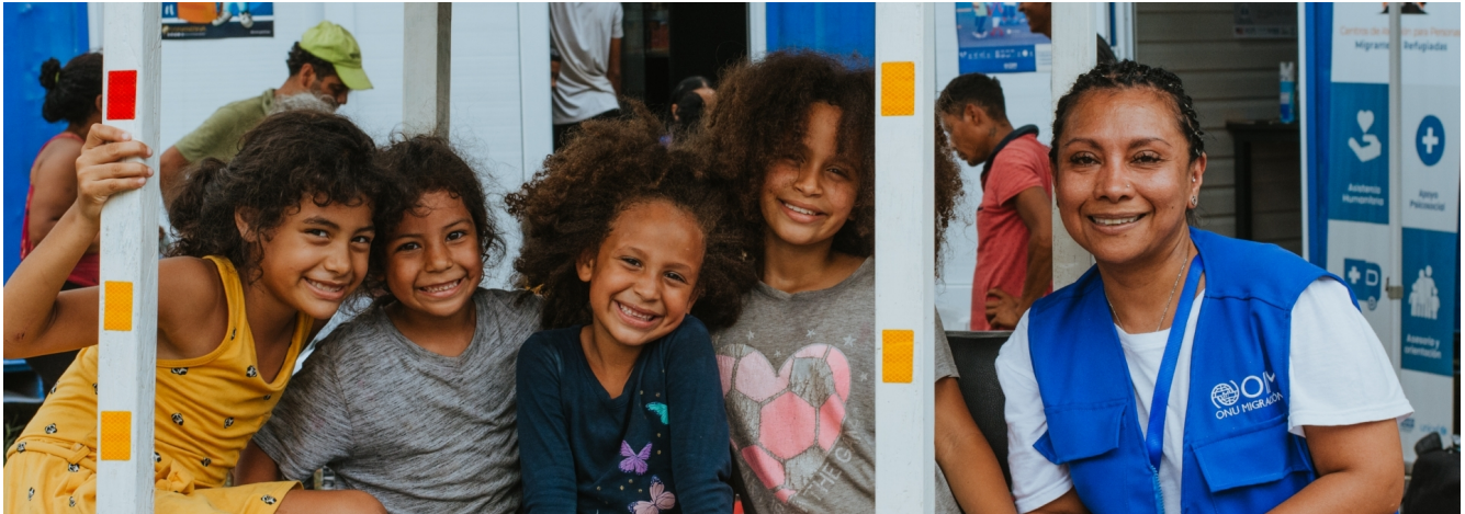
Beneficiaries at the Migration Response Centre in Tecun Uman, Guatemala.